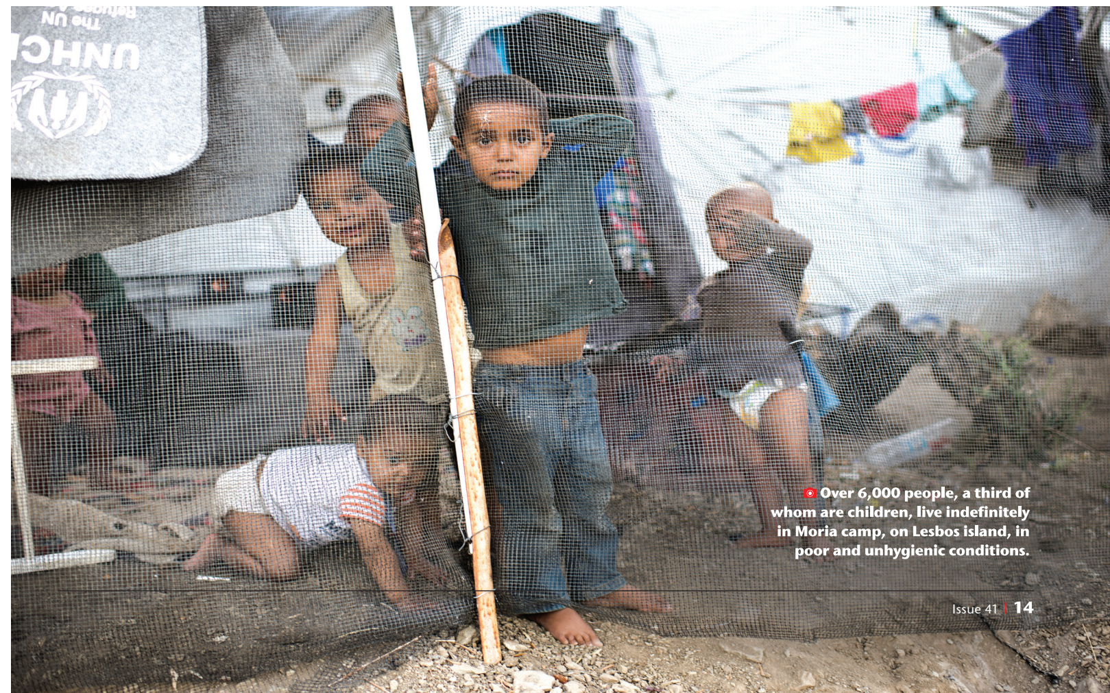
• Over 6,000 people, a third of whom are children, live indefinitely in Moria camp, on Lesbos island, in poor and unhygienic conditions.