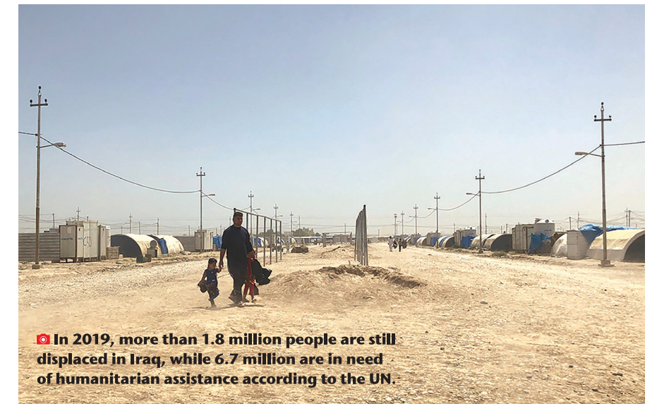
■ In 2019, more than 1.8 million people are still displaced in Iraq, while 6.7 million are in need of humanitarian assistance according to the UN.