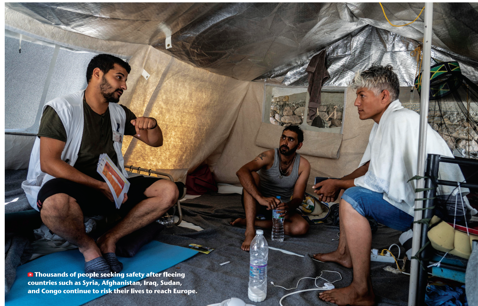
• Thousands of people seeking safety after fleeing countries such as Syria, Afghanistan, Iraq, Sudan, and Congo continue to risk their lives to reach Europe.

I work with Arabic speakers, who are mostly from Syria and Iraq, however in the camp people mainly come from the Middle East and Africa. The vast majority have left their country because of war, violence and persecution. I left for the same reasons, so I understand what they have been through. Sometimes, our Middle Eastern culture doesn't allow us to express ourselves immediately to others. So after time and after they gain our trust, they reach out to me to tell me about the problems they faced in their country. From our side, we try to help them and refer them to be housed or to be moved to a safer space. ■