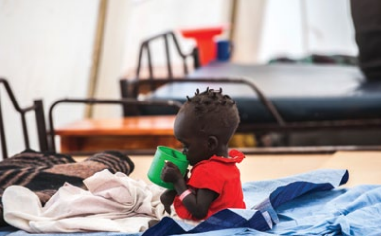
بدأت معدلات سوء التغذية وأعداد الوافدين الجدد تنخفض. ينتظر اللاجئون ليحل السلام على بلادهم للعودة إلى ديارهم.

When families first arrive, they live in UNHCR tents and receive a few items to cook and stay warm.