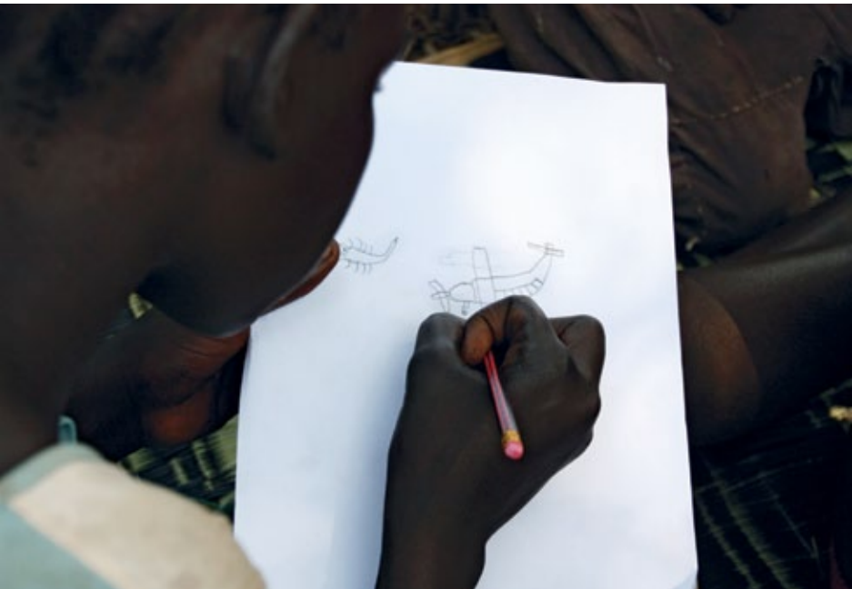
In a refugee camp in South Sudan, children are asked to draw what frightens them the most. Almost everyone draws an aeroplane.

“A grandmother in one of the families was suffering from very bad depression, and just spent her day lying passive in the hut, doing this for the last three months,” says Stempel.