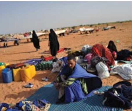
Malian refugees in Mauritania. October 2012

Following the bombardments in Lere, several hundred people have crossed the border into Mauritania. MSF’s teams in Mauritania have initiated their emergency response plan and are currently on site providing assistance.