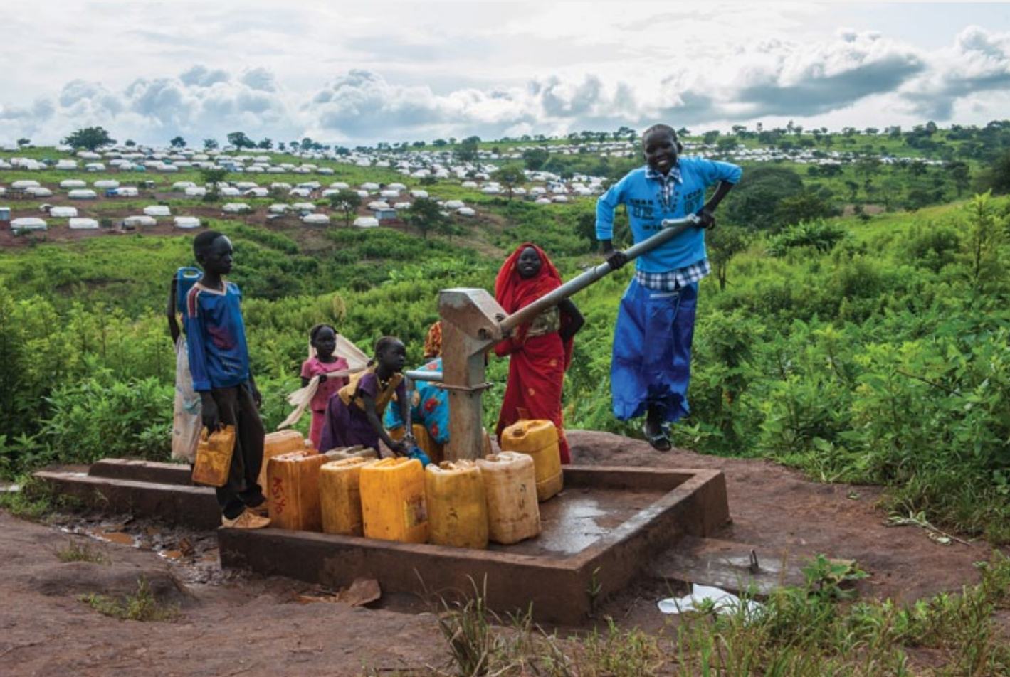
Boreholes equipped with hand pumps provide a source of drinking water.

يتم تجهيز البئر بمضخات يدوية كوسيلة لتوفير المياه الصالحة للشرب.