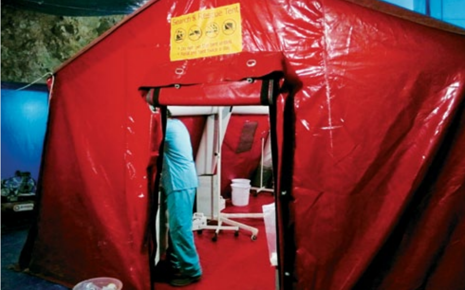
The entrance of the inflatable surgical unit inside MSF's makeshift hospital.

In this heavily polarized conflict, how can we ensure the neutrality of our facilities? The violence is contagious, but so is a kindness that is shown to all. Whether it was through formal dialogue with one or other head of the armed groups, or through the daily treatment delivered with the same attention to all, regardless of their political or religious opinions, our Syrian co-workers quickly understood that we were neutral in this conflict. Despite this heavily polarized conflict, it has been possible to make our health care unit a peaceful facility where simple gestures of solidarity can be made, and to restore dignity to the wounded, whatever their background.