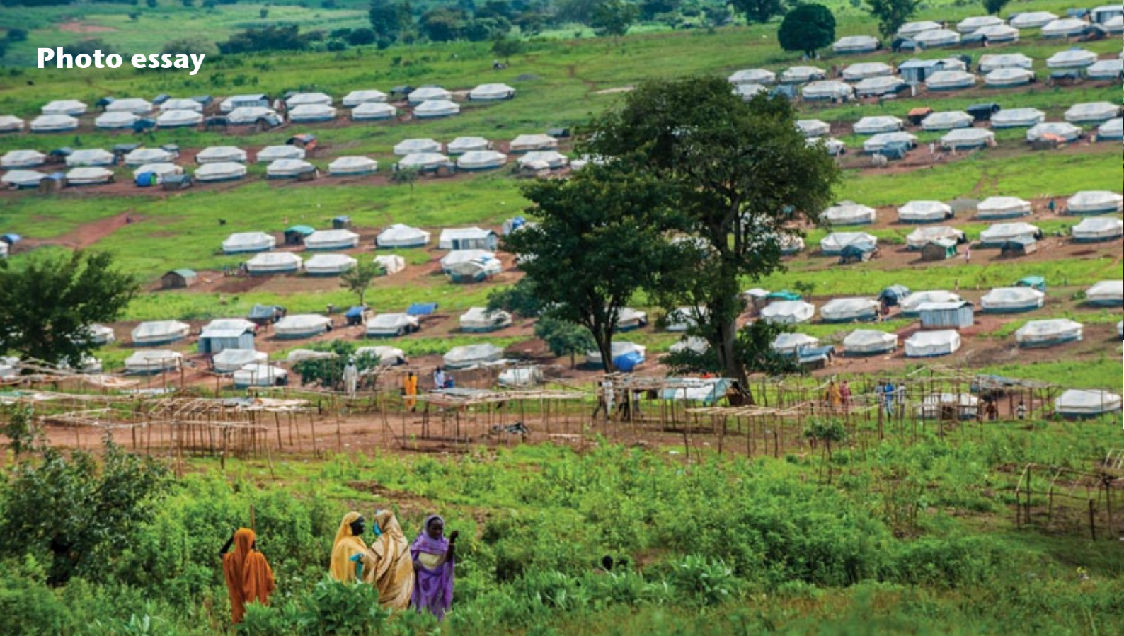
تصطف أكثر من ٢,٠٠٠ خيمة بيضاء على التلال الخضراء بالقرب من قرية بامباسي في غرب إثيوبيا. ومنذ شهر يوليو/تموز، شكلت مأوى لنحو ١٢,٠٠٠ من اللاجئين السودانيين الذين فروا من وطنهم. يتمتع المخيم بسعة استيعابية تستقبل نحو ٢٠,٠٠٠ شخص.

More than 2,000 white tents line the green hills near the village of Bambasi, in western Ethiopia. Since July 2012, they have been home to 12,000 Sudanese refugees who fled the conflict in their homeland. The camp has a total capacity of 20,000 people.