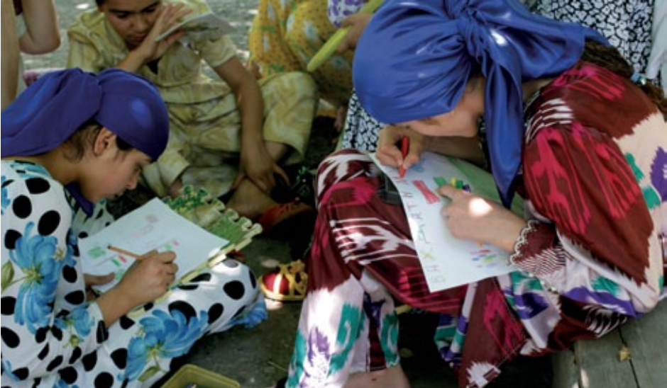
Young MDR-TB patients take part in developmental activities at the pediatric hospital in Dushanbe, Tajikistan.

MSF’s project treats children as outpatients where possible, to allow them to live as normal a life as they can, and works with schools to encourage them to allow children to rejoin lessons once they are no longer infectious.