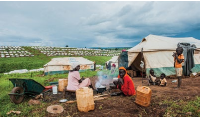
تعيش الأسر النازحة عند وصولها في خيام تابعة لمفوضية الأمم المتحدة لشؤون اللاجئين وتحصل على بعض المواد المعينة بالطبخ والتدفئة.

All images: Ethiopia 2012 © Yann Libessart