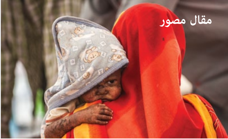
كثيراً ما ترتبط الحالات الحادة من سوء التغذية بأمراض مثل الأمراض الجلدية.

Around 3,000 households, usually with pregnant or nursing women and children under five, have been registered to receive supplementary food.