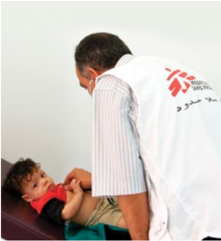
A pediatrician examines a child at the new MSF clinic on the outskirts of Cairo.

Médecins Sans Frontières (MSF) has opened a new clinic on the outskirts of Cairo, providing healthcare to mothers and children.