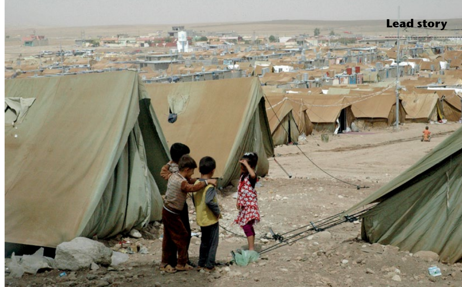
The Domeez refugee camp in Iraq, where MSF has been treating Syrian refugees since May 2012.