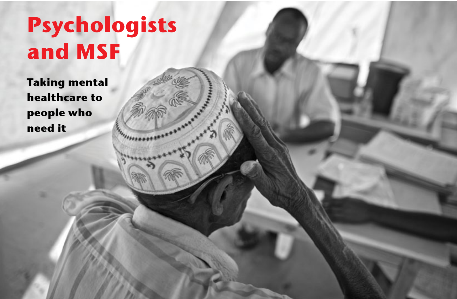
An old man tells his story during a mental health consultation in Dagahaley camp. Kenya 2012

Taking mental healthcare to people who need it