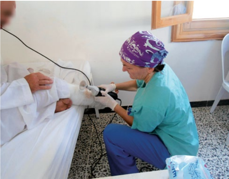
MSF has been providing surgical care in the north of Syria since June 2012.

MSF teams are working in three hospitals in northern and northwestern Syria. MSF provides emergency medical care there, including surgery and medical consultations.