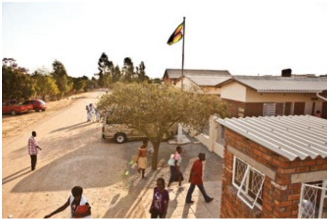
The clinic built by MSF in Epworth, Zimbabwe, where patients receive medication and care free of charge.