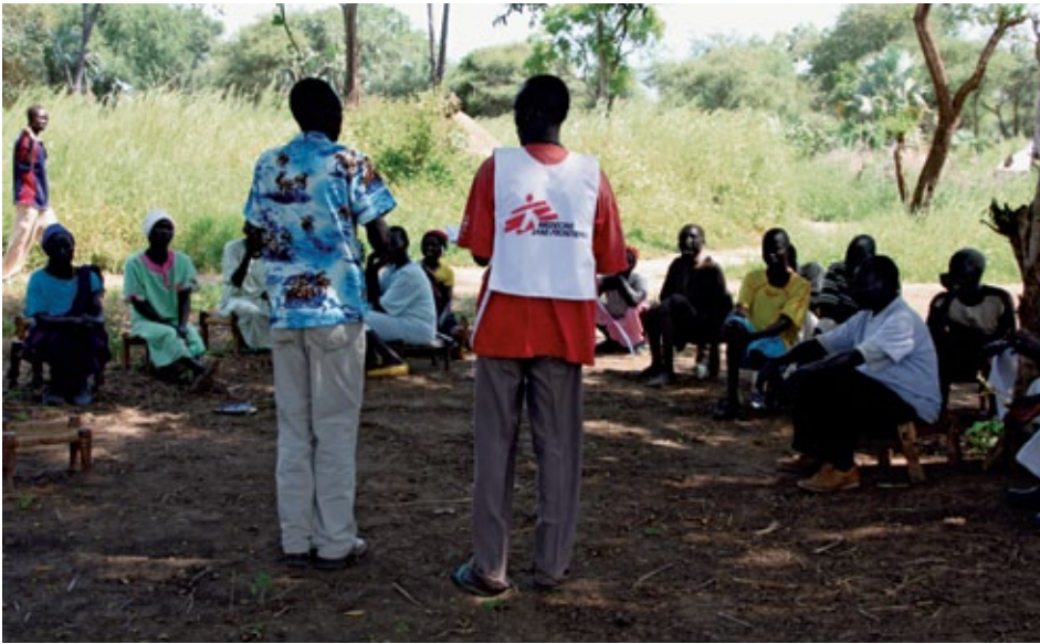
A group session in the refugee camp in Maban County, South Sudan.

Many refugees are living with chronic stress, which shows itself in psychosomatic complaints such as headaches or stomach aches affecting not only the patient but the whole family.