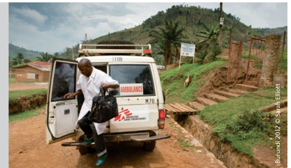
Burundi 2012