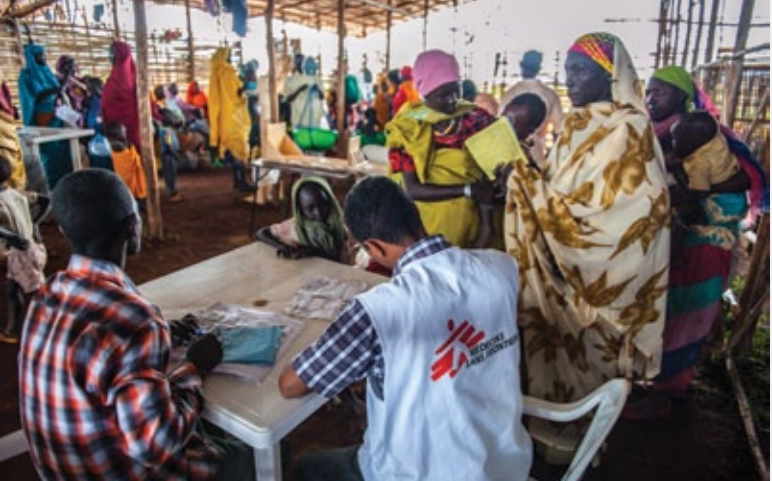
تم تسجيل نحو ٣,٠٠٠ أسرة للحصول على الأطعمة التكميلية. تضم هذه الأسر عادة امرأة حامل أو أم مرضعة وأطفال دون سن الخامسة.

Malnutrition rates are now decreasing and the number of new arrivals is shrinking. Refugees await peace in Sudan to return home.