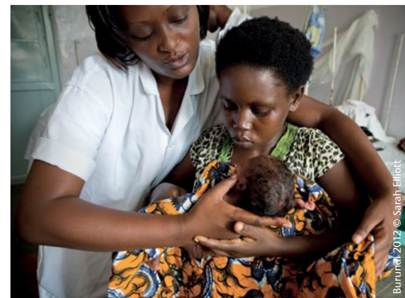
Burundi 2012

"My water broke early, I was very afraid because it was too soon. I went to the nearest health centre at Gitaza. It was one and a half hour walk away. An ambulance from MSF came to pick me up. The health centre called them because they said they weren't able to help the baby. If MSF was not here, I could have died and my baby too."