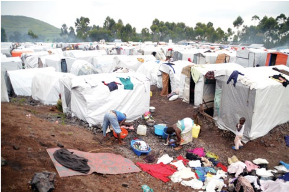
Kanyaruchinya, a camp for people displaced by violence in North Kivu, Democratic Republic of Congo. The camp is about 15 kilometres north of Goma.

An already fragile humanitarian situation in eastern Democratic Republic of Congo deteriorated further when a rebel group known as M23 marched on the city of Goma in North Kivu Province in mid November 2012.