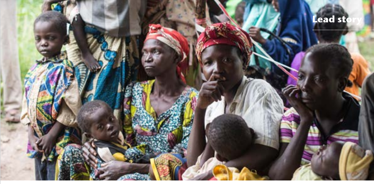
Waiting at an MSF hospital in Bossangoa, Central African Republic.