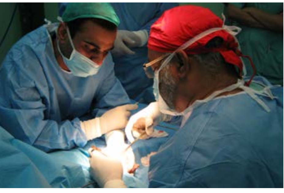
MSF doctors are now operating at a second hospital in Gaza.

There is a room set aside for hand physiotherapy in the MSF clinic. Most patients are children. MSF teams at the clinic also treat patients referred by the Ministry of Health and other facilities. In addition to the surgery programme, MSF has worked with the Ministry of Health to provide intensive care training at Al-Shifa hospital for doctors from several Gaza hospitals.