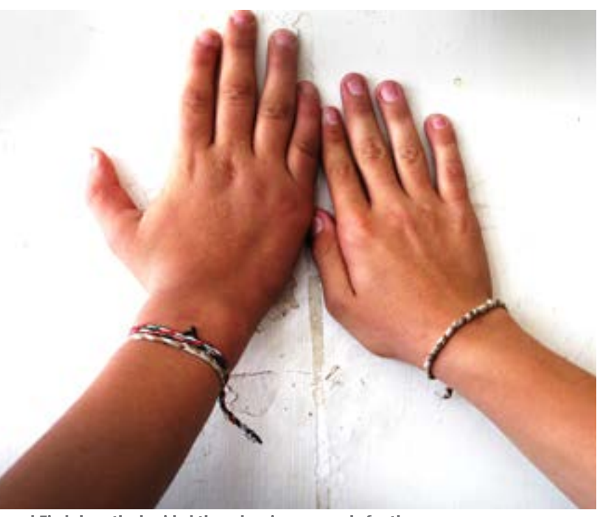
Hussein and Ziad show the braided threads prisoners made for them.

After serving the customary tea and cold drinks for the visitors, Hussein's mother sits with the translator, journalist and the two boys in their modest living