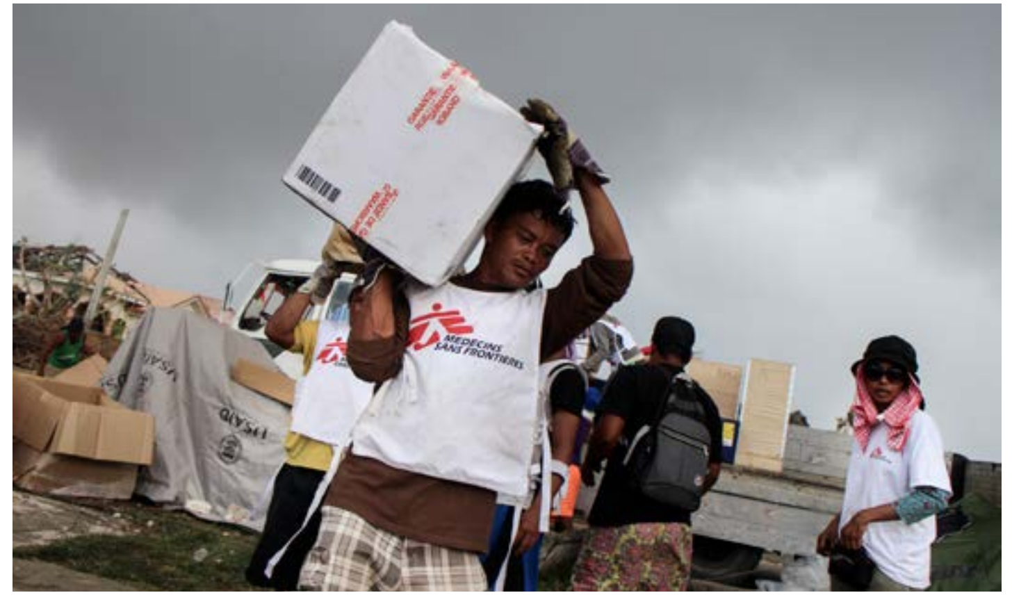
MSF international and local staff unload supplies at MSF's tent hospital in Guiuan.

In the days after Typhoon Haiyan hit the Philippines, Médecins Sans Frontières (MSF) faced huge logisitical challenges to get emergency aid where it was needed most. Within days, MSF had brought in more than 150 staff and hundreds of tonnes of supplies, but continuing bad weather, damaged infrastructure and a scarcity of fuel and vehicles all had to be overcome to transport staff and supplies to affected areas. Now, as the emergency phase passes, MSF's work continues with a focus on restoring quality primary healthcare and hospital services.