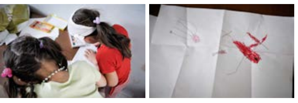
Children drawing as part of a mental health consultation in Syria.