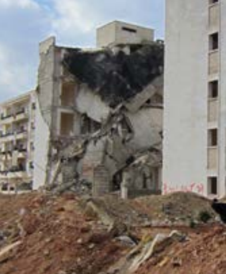
A street scene from Aleppo.

So I looked her in the eye and held her – more supported her – in my arms and stroked