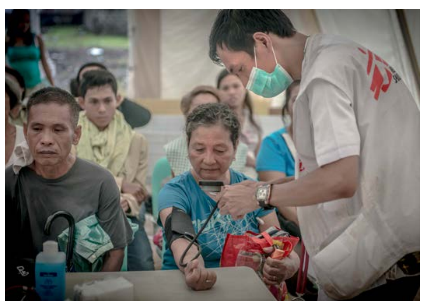
An MSF doctor meets with patients in the days following Typhoon Haiyan.