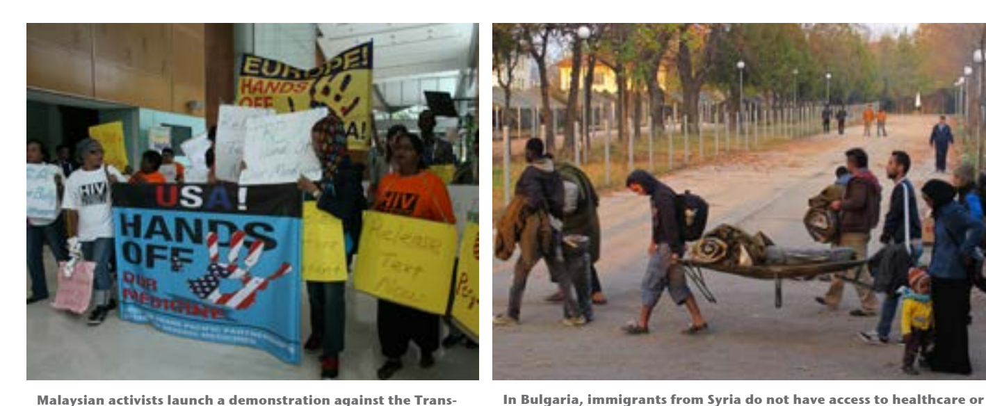
Malaysian activists launch a demonstration against the Trans-Pacific Partnership Agreement.