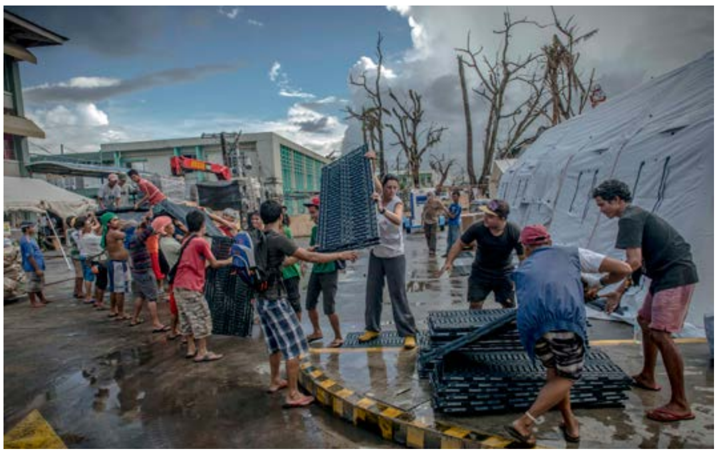
MSF's inflatable hospital under construction, Tacloban. The hospital consists of four inflatable tents with an emergency room, woundcare room, pharmacy and up to 45 hospital beds.