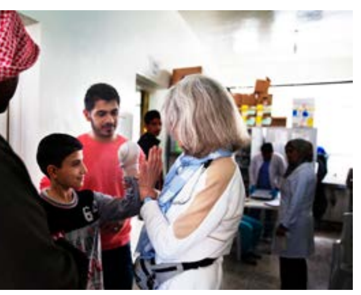
After surgery, a child receives follow-up care at MSF's hospital in Aleppo