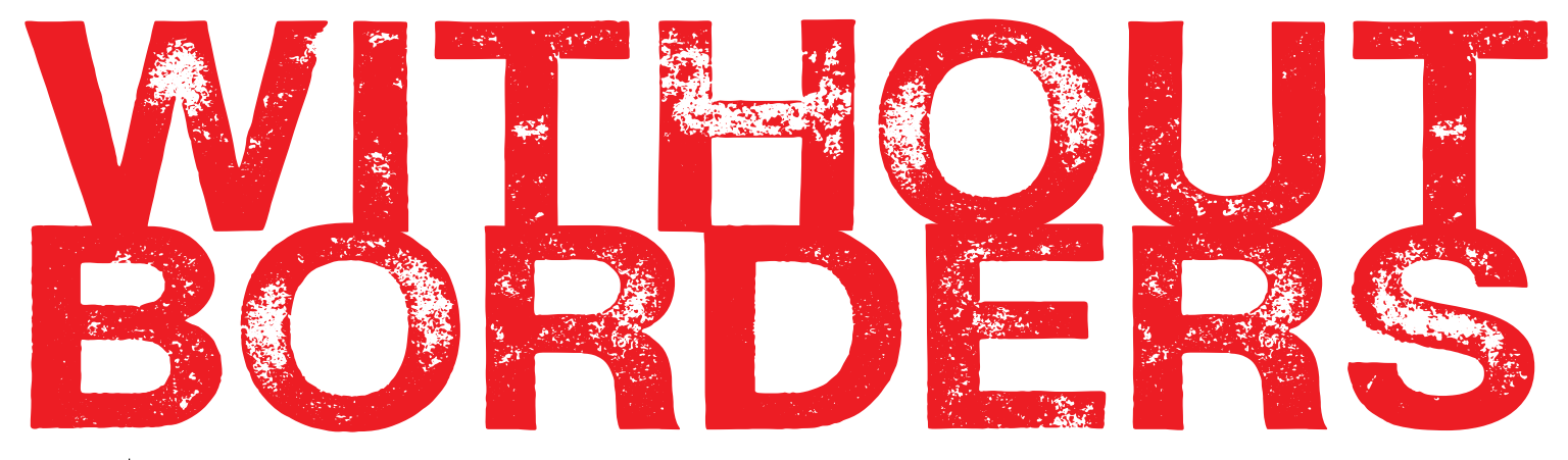
Issue 30 October - December 2015