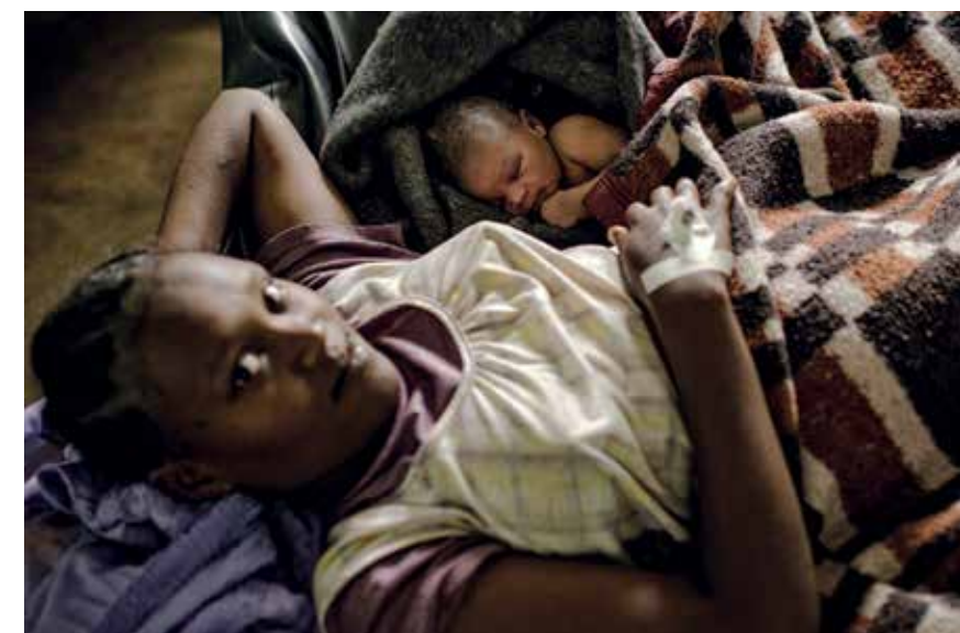
• A mother and her baby at the MSF health centre in Chire.