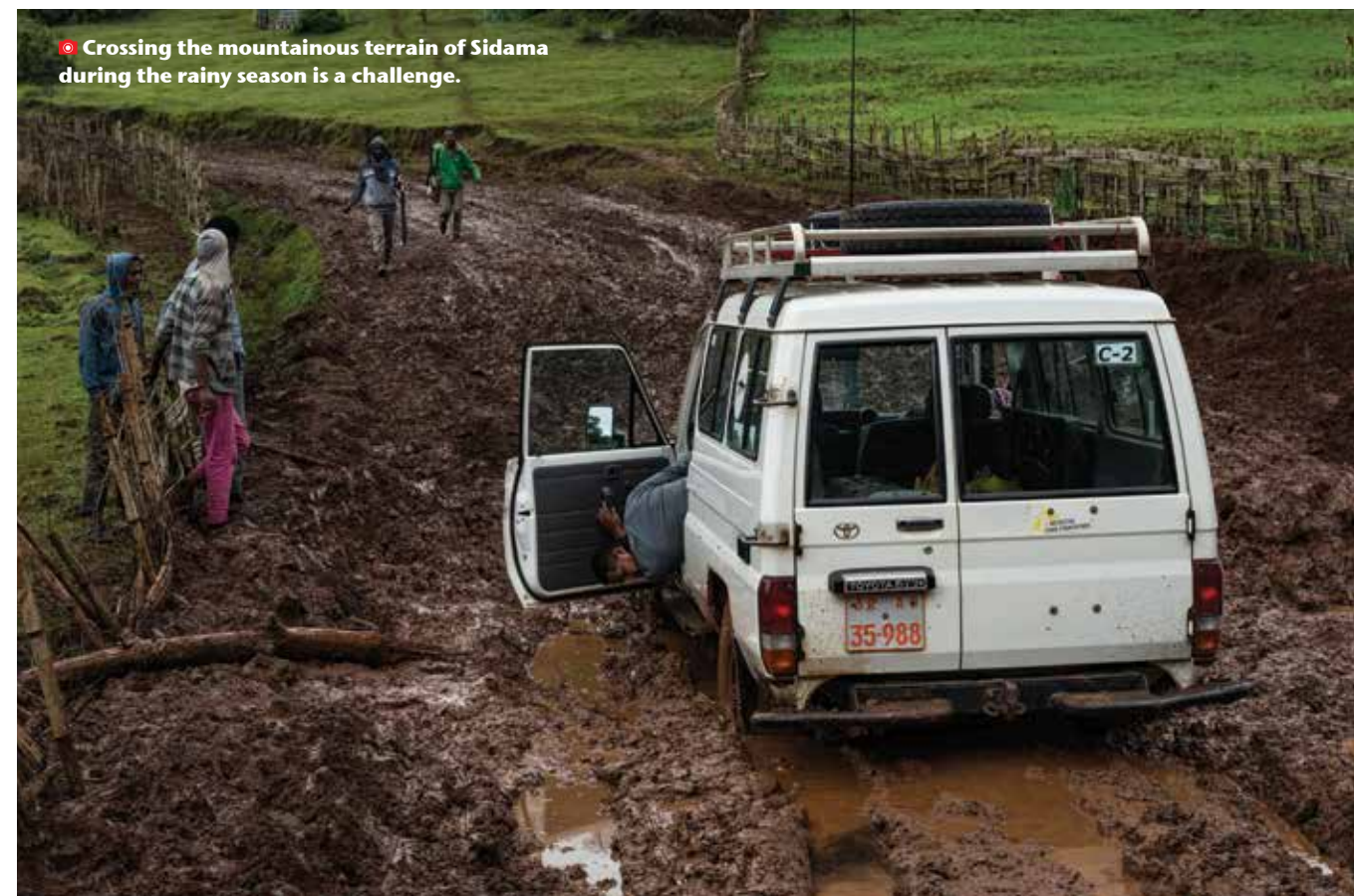
• Crossing the mountainous terrain of Sidama during the rainy season is a challenge.