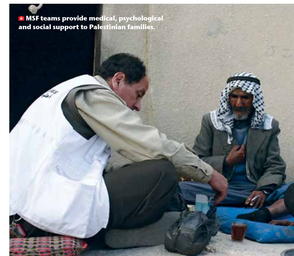
■ MSF teams provide medical, psychological and social support to Palestinian families.