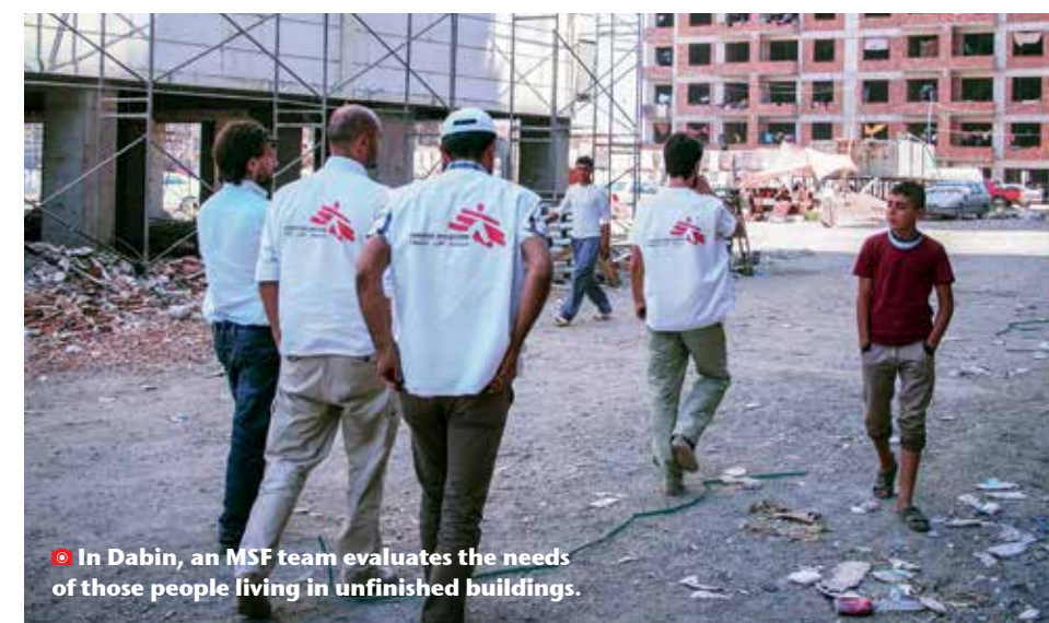
• In Dabin, an MSF team evaluates the needs of those people living in unfinished buildings.

On the site grounds, the 20 latrines available that are overflowing with sewage are far from a solution. The stench and flies are overwhelming; a terrible scene. Fifty more toilets are in the process of being installed, but the developers have already threatened legal action against anyone digging the property grounds.