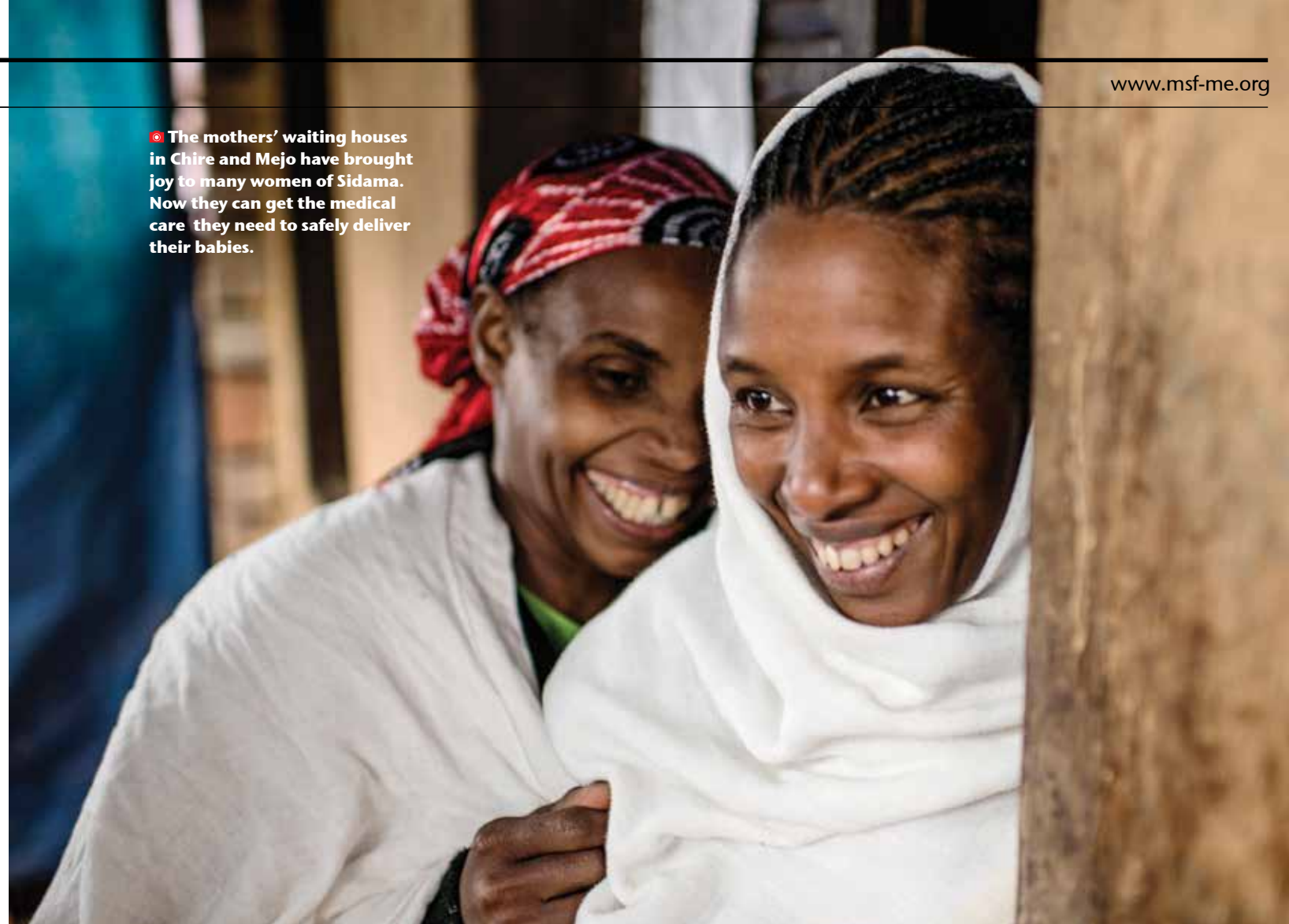
• The mothers' waiting houses in Chire and Mejo have brought joy to many women of Sidama. Now they can get the medical care they need to safely deliver their babies.