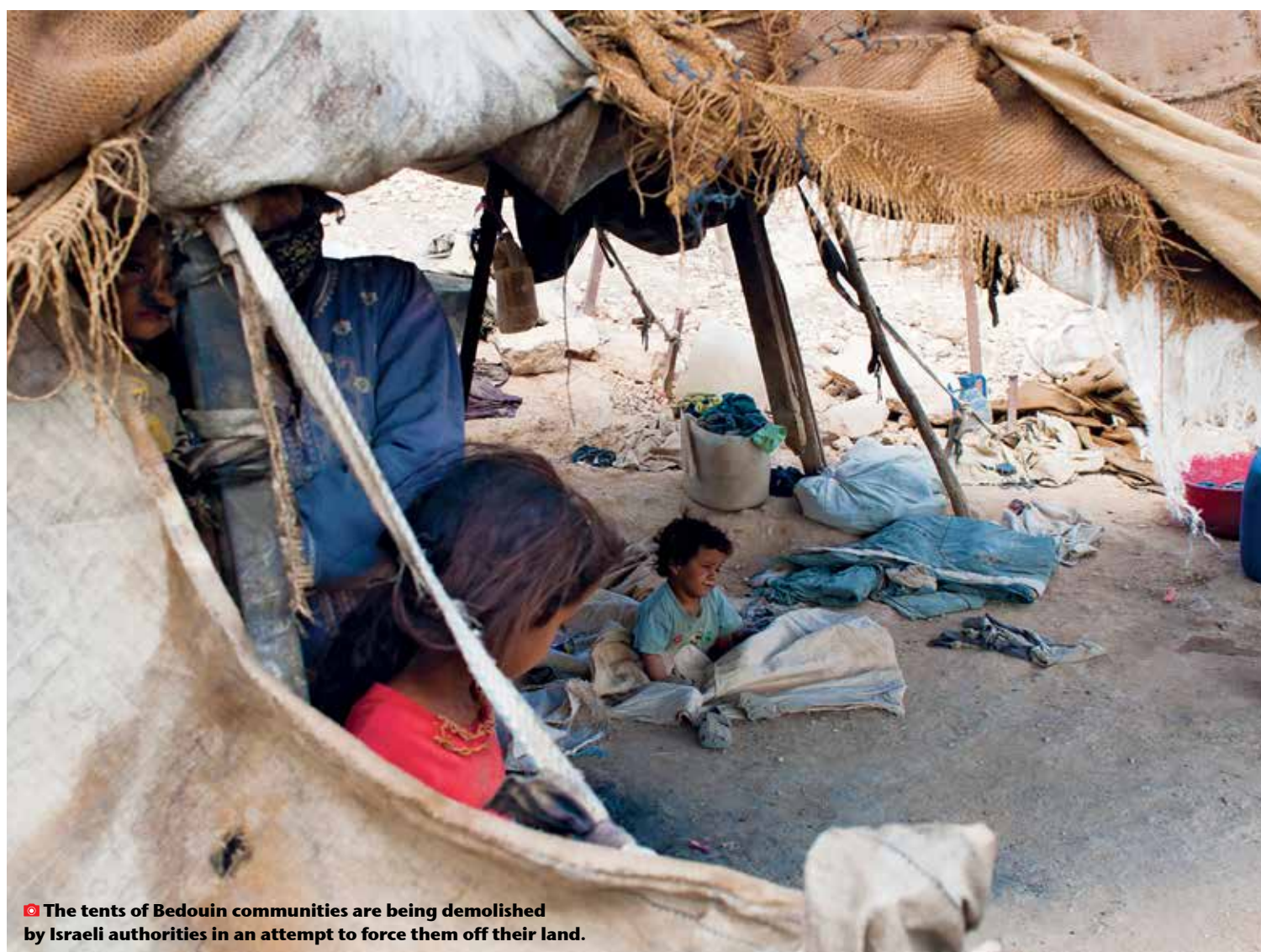
■ The tents of Bedouin communities are being demolished by Israeli authorities in an attempt to force them off their land.

"We need somebody to share our feelings with and to know the suffering we are going through."