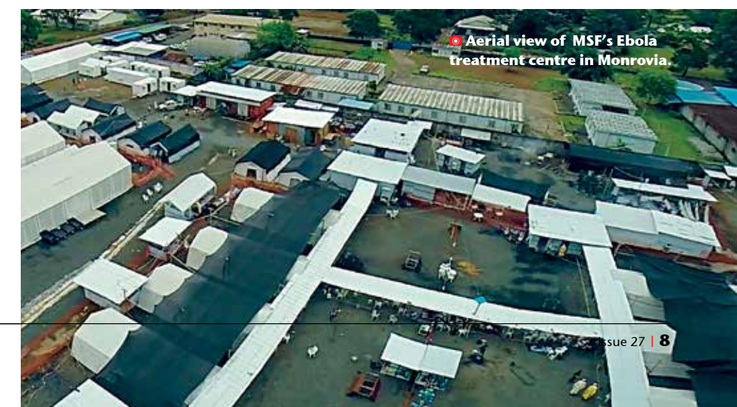
• Aerial view of MSF's Ebola treatment centre in Monrovia.

MSF has shipped more than 1,300 tonnes of equipment and supplies to affected countries to help fight the epidemic.