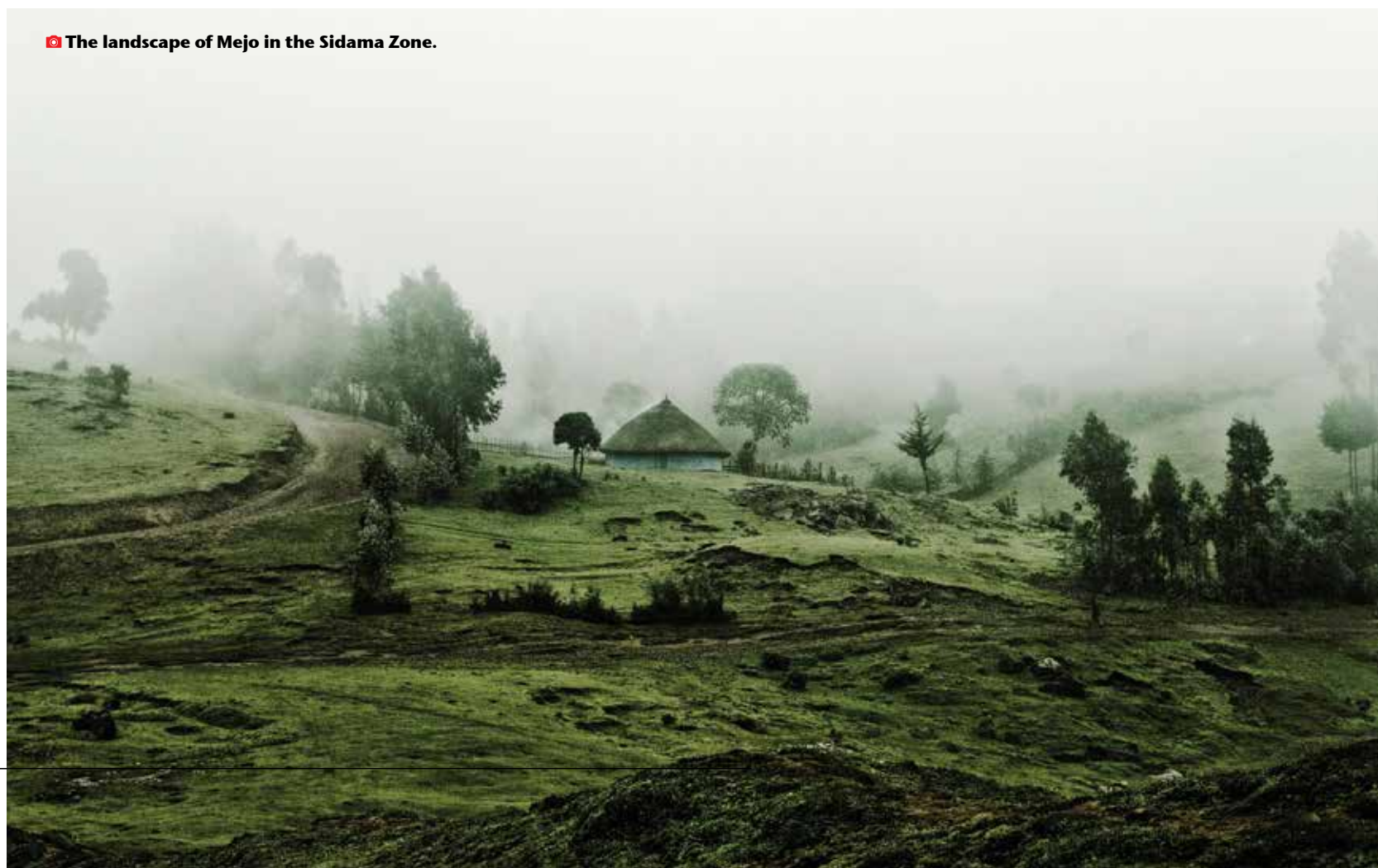
• The landscape of Mejo in the Sidama Zone.

As well as providing health care to mothers and their babies, MSF also provides medical care for young children in Sidama. Since 2012, MSF has treated more than 1,700 severely malnourished children and admitted nearly 2,000 children under the age of five for specialised inpatient care. ■