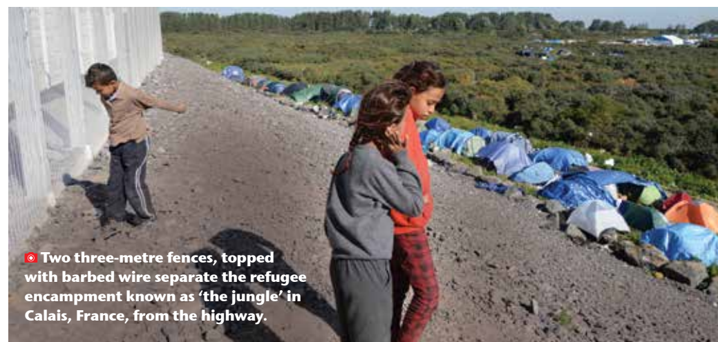
• Two three-metre fences, topped with barbed wire separate the refugee encampment known as ‘the jungle’ in Calais, France, from the highway.

Everyone is concentrating on the ‘refugee crisis’, for me it’s not a crisis, I lived in Syria for the last four or five years of the war and I took the trip, so I know the difference. I don’t think it’s a crisis and I think that the real crisis is inside Syria. We know that they have some difficult situations, but nothing can compare to the situation for people living inside the country.”