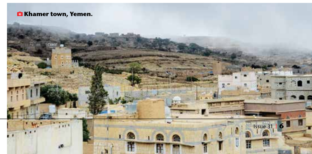
• Khamer town, Yemen.

"I found it amazing to work with teams who could face air strikes in the evening and arrive at work on time."