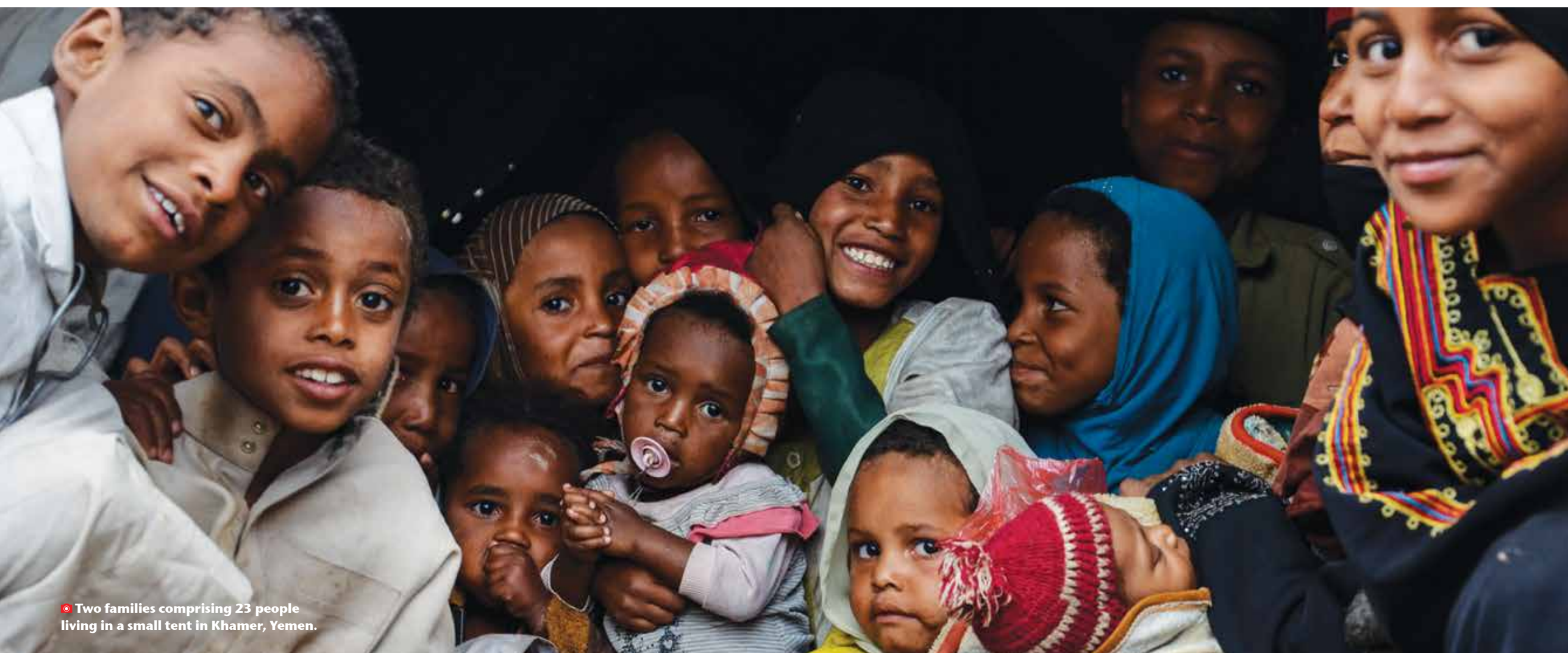
• Two families comprising 23 people living in a small tent in Khamer, Yemen.

because they are too close to military bases or camps, increasing the risk for staff and patients.