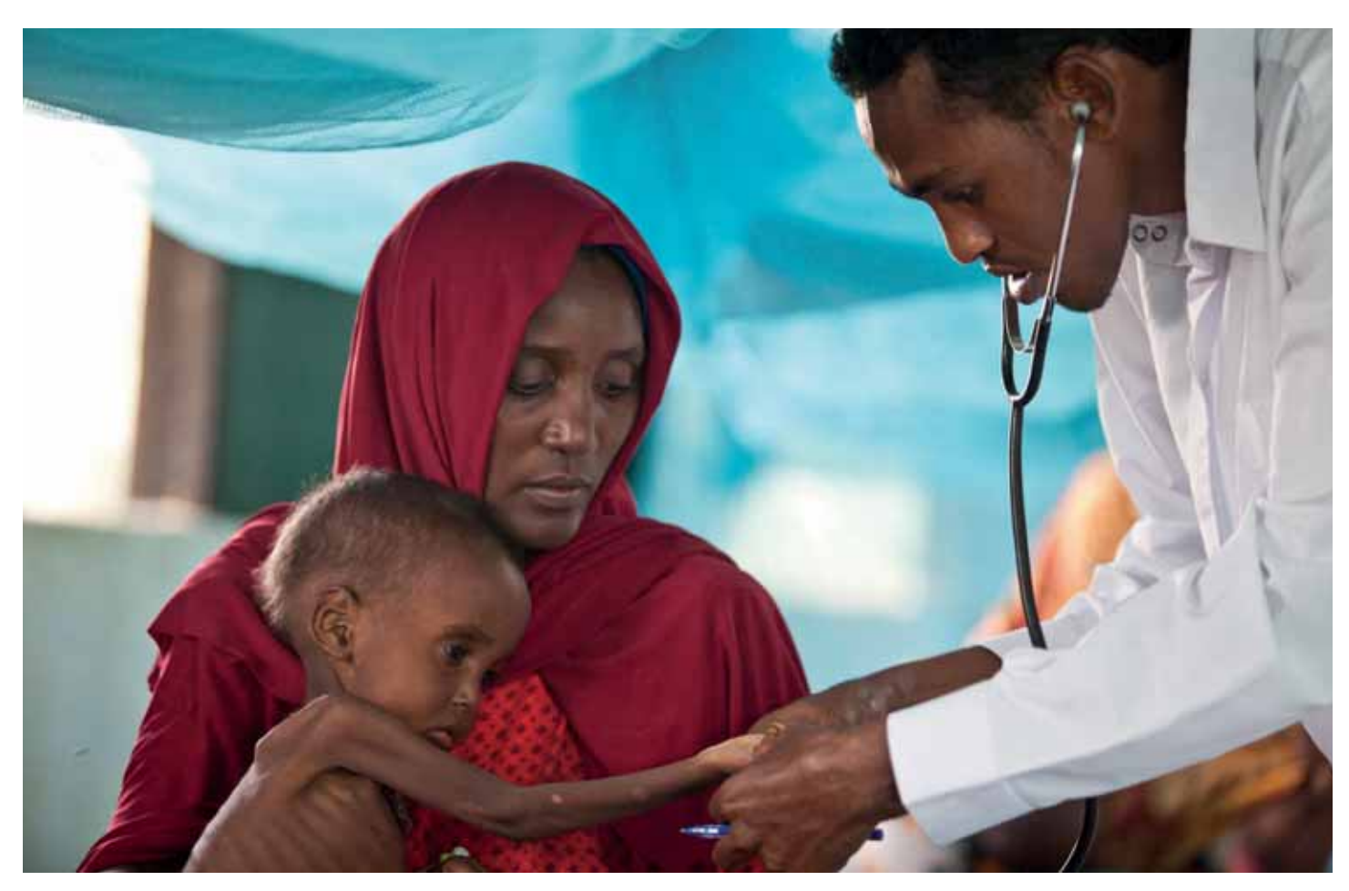
A severely malnourished child being examined by an MSF medical officer in Kenya's sprawling Dabdaab refuge camps.

As a Somali myself, I can say that if MSF was not here, we would be like a boat that has run out of fuel in the middle of the Indian Ocean. Without MSF's help, thousands would have died."