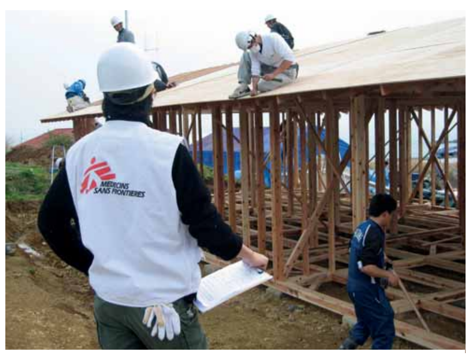
Japan: MSF staff oversee construction of a temporary shelter by local evacuees at Baba-Nakayama, Minami-Sanriku.

MSF also established a café at the Bayside Arena Clinic in Minami Sanriku as a space where evacuees can interact with MSF staff directly in a less formal and more social environment. This enables staff to meet the population directly, build trust and identify vulnerable cases for further referral and therapeutic treatment.