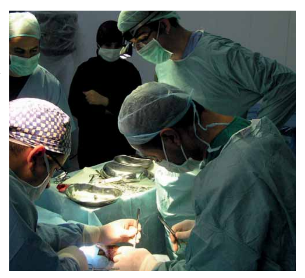
A surgical operation at MSF-supported Abbad Hospital in Misrata, Libya.

People here don't cry easily or show their emotions much. But when there has been a day of heavy fighting, you can see that our counterparts, the local medical staff, are very down. You see that it hits morale very hard. But they have no other way than carrying on.