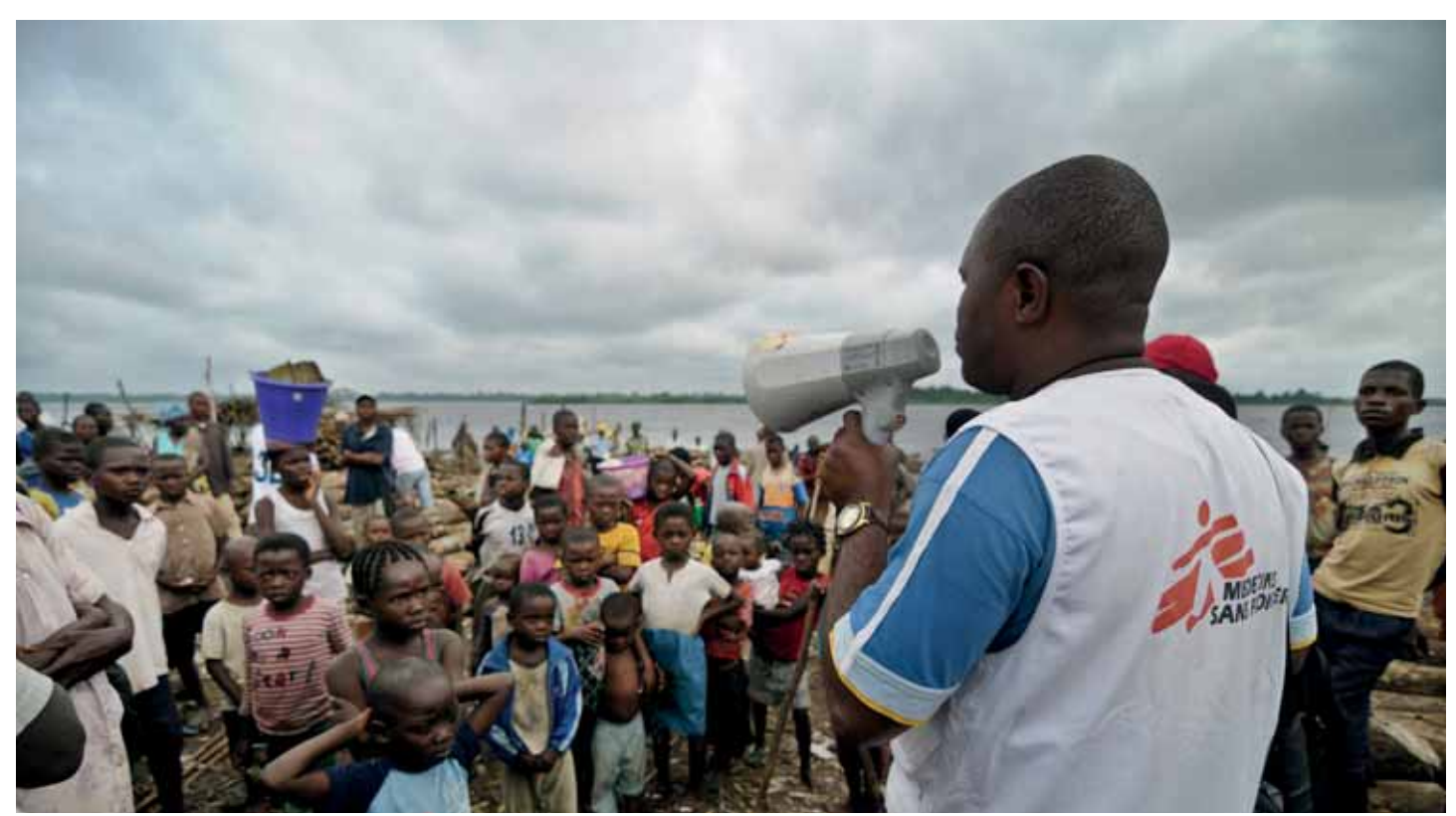
DRC: During a day of health promotion in Mbandaka, an MSF health worker attracts a crowd in the port area, where many of the cholera cases are coming from. His role is to spread the word about the cholera epidemic - what is cholera, how to avoid catching it, and what to do if anyone has the symptoms of the disease.

Since the start of the Haitian cholera epidemic in October 2010, cholera has killed more than 5,000 people from among the 330,000 reported cases. MSF has treated more than 140,000 patients all over Haiti.