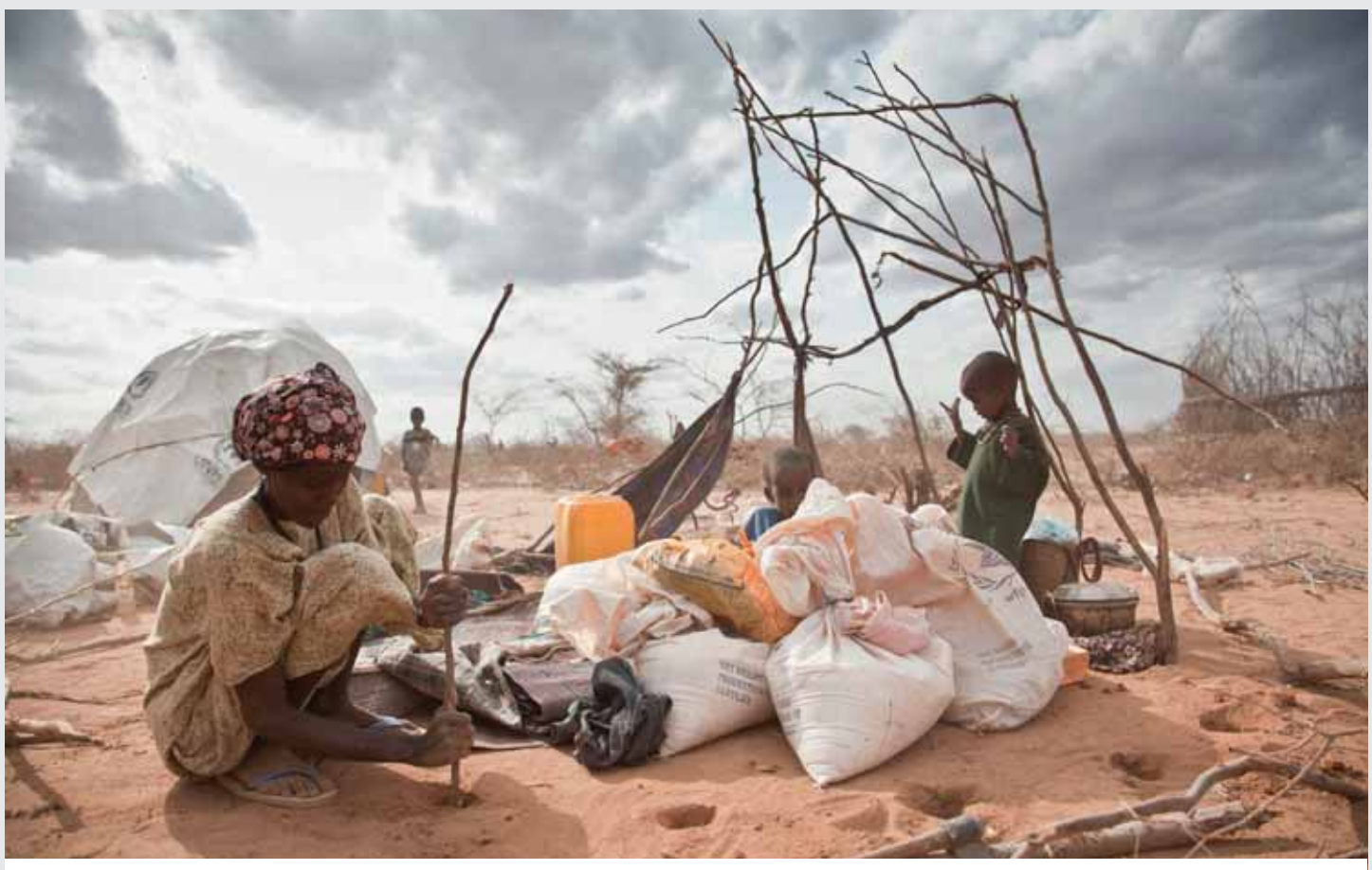
A refugee uses twigs and scraps of material to build a shelter for her family. There is no room for most new arrivals in the Dadaab camps, so the thousands of people who arrive every week must fend for themselves in the surrounding desert.