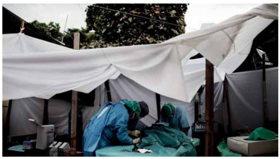
A surgical team carries out a lifesaving procedure on a young girl in a makeshift operating theatre in Port-au-Prince, Haiti.

At the end of 2010, MSF was caring for over 210,000 people with HIV and more than 183,000 patients were receiving antiretroviral treatment.