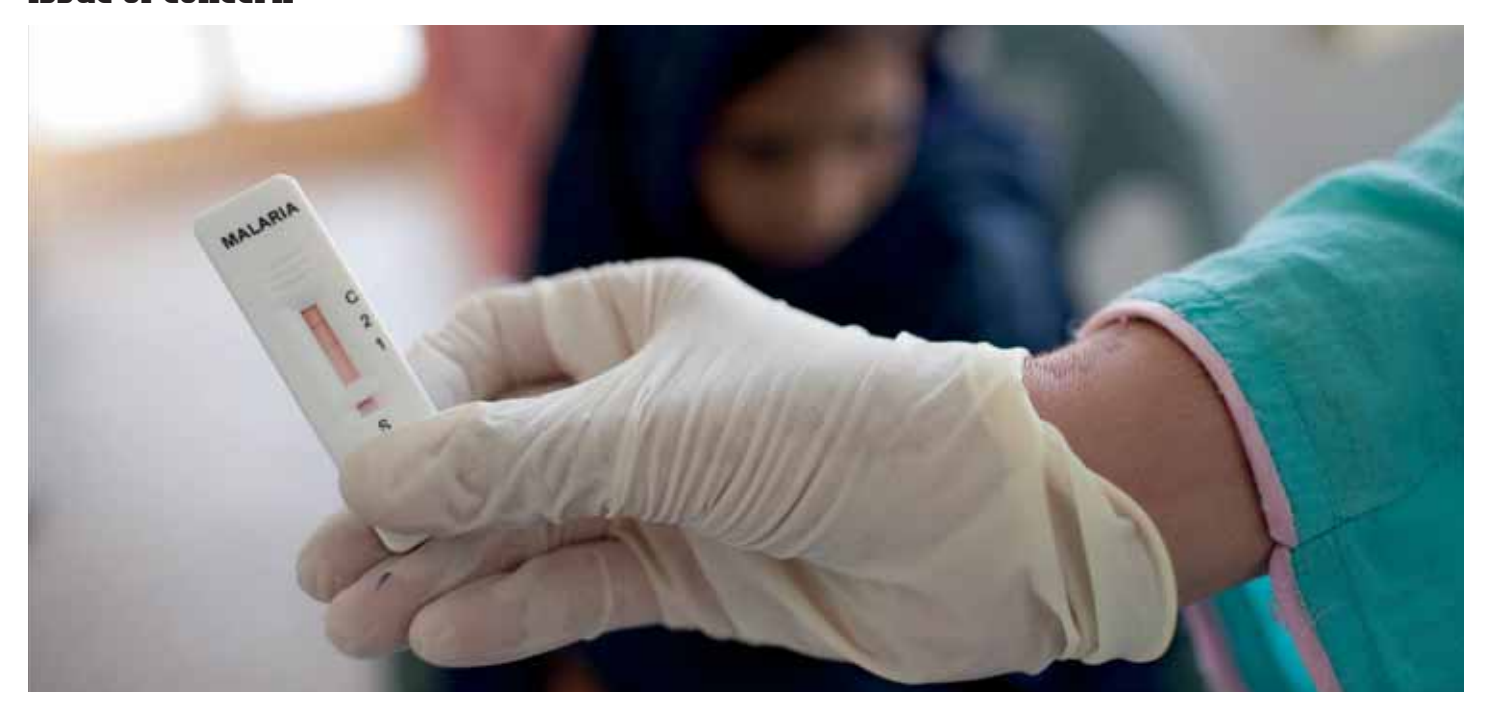
Malaria is detected in an 8-year-old girl in Pakistan.