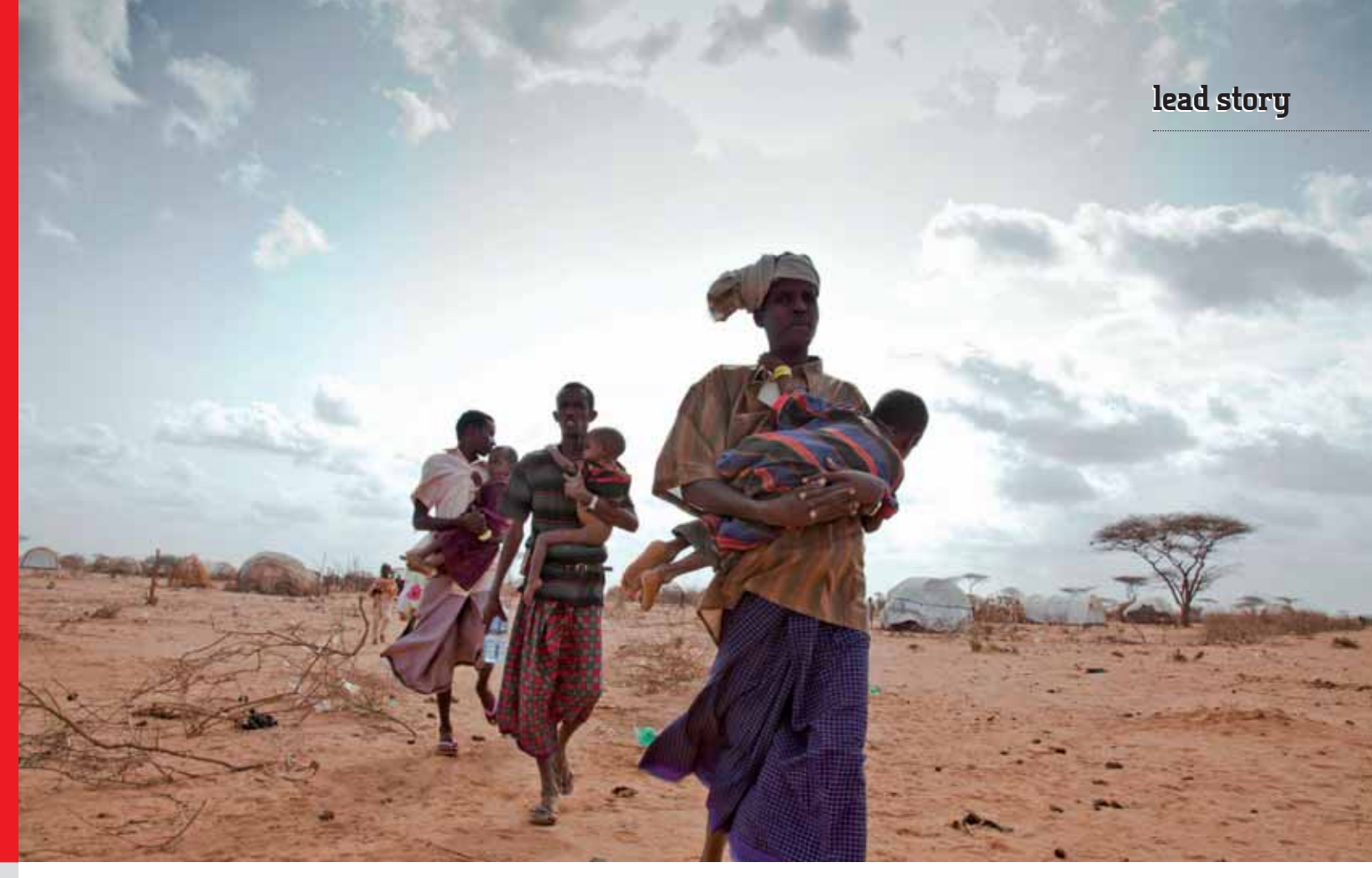
Somali refugees who have fled drought and violence carry their sick and malnourished children to an MSF feeding centre on the outskirts of a refugee camp in Dadaab, Kenya.