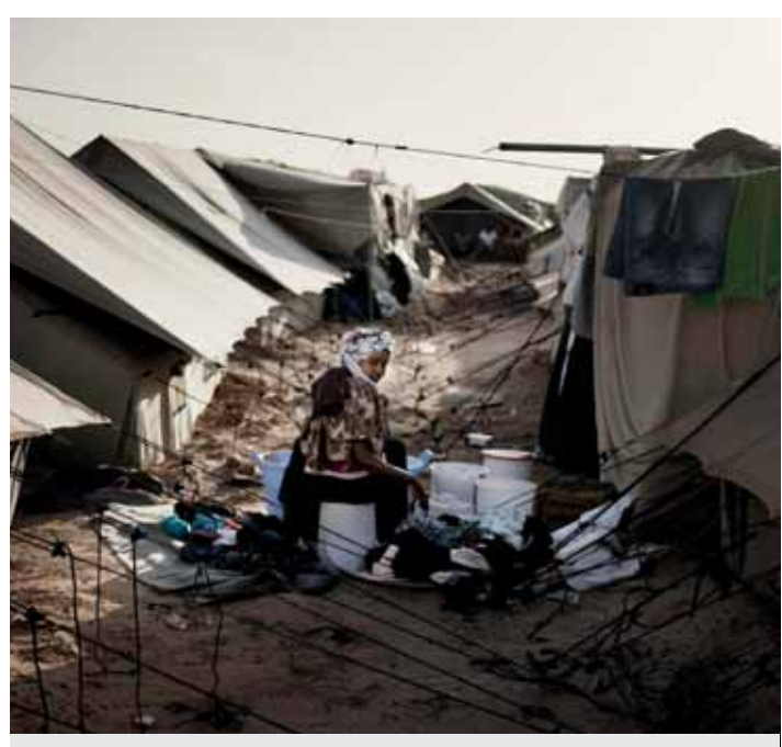
امرأة صومالية تغسل الملابس في مخيم شوشة. A Somali woman washing clothes at the camp.