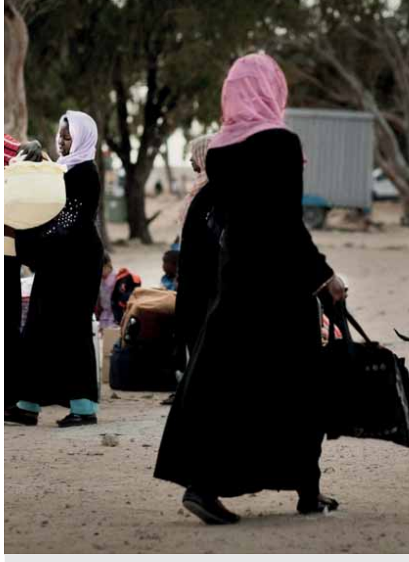
Sudanese families arriving at Shousha Camp at the Tunisian border with Libya.

MSF has made repeated calls to those states involved in the war in Libya to better receive, assist and protect its victims. We have also drawn attention to the fact that while Tunisia and Egypt have accepted nearly 630,000 people fleeing Libya, European states involved in the war have turned back people who are risking their lives to reach Europe.