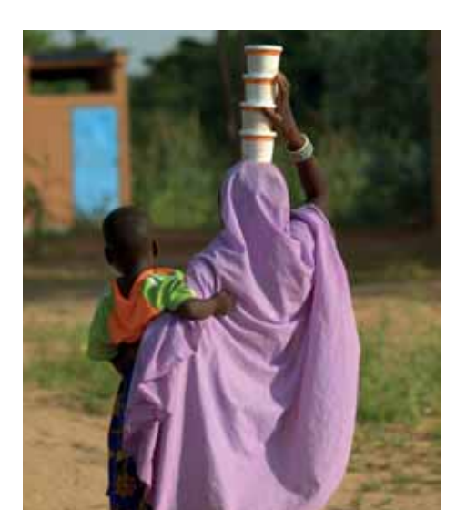
A mother takes home a supply of ready-to-use food in Madarounfa, Niger.