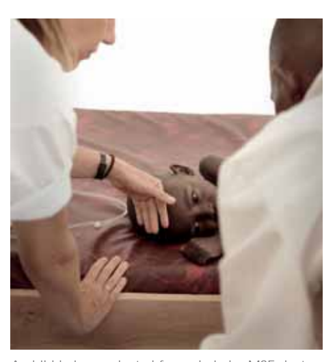
A child being evaluated for malaria by MSF doctors in Burundi.

MSF provided malaria treatment to around one million people in 2010.