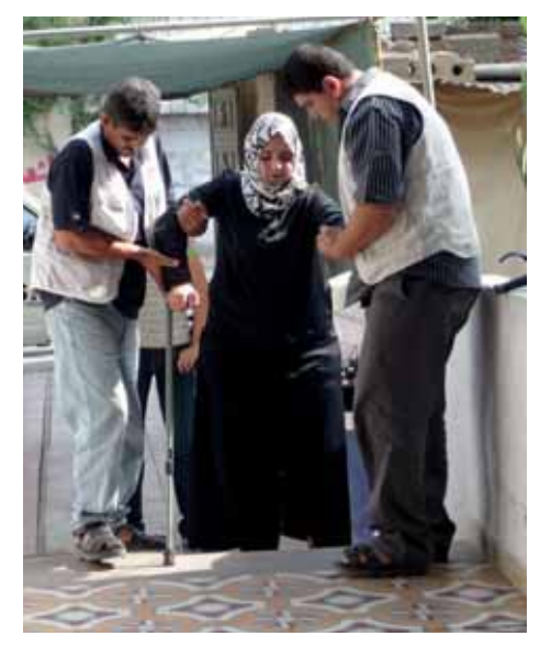
Staff help a patient outside the post-operative care clinic at Nasser hospital, Gaza.

Worldwide, MSF brought aid to over 301,000 children suffering from severe malnutrition in 2010.