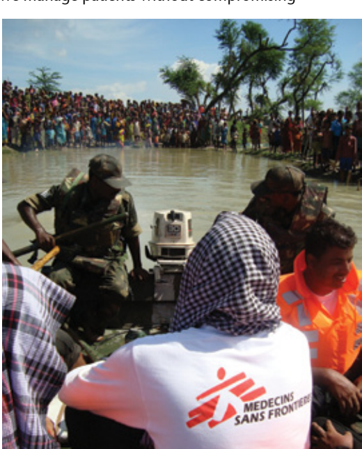
Travelling by boat to reach families stranded after the

Yes. We don't often get the latest drugs or equipment that we want into the country because of licensing or import restrictions. So MSF has developed protocols to deal with such situations by providing alternative options. The protocols guide you, if you don't have a particular drug, what is the other alternative and how do you manage this case? If we stick to the MSF protocols that we have, we manage patients without compromising