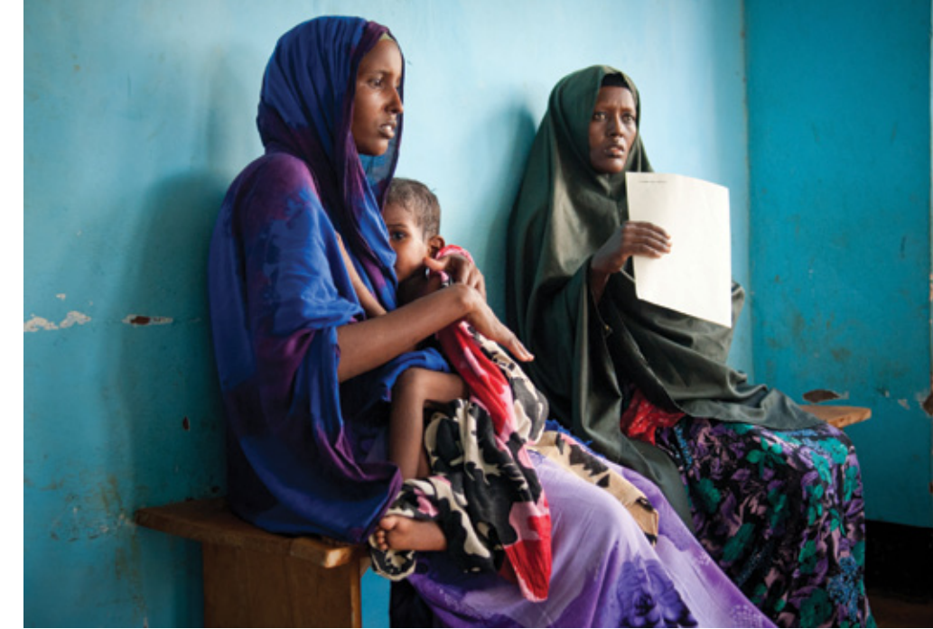
Mothers with young children waiting to be seen by the medical doctor at the MSF hospital in Guri El.