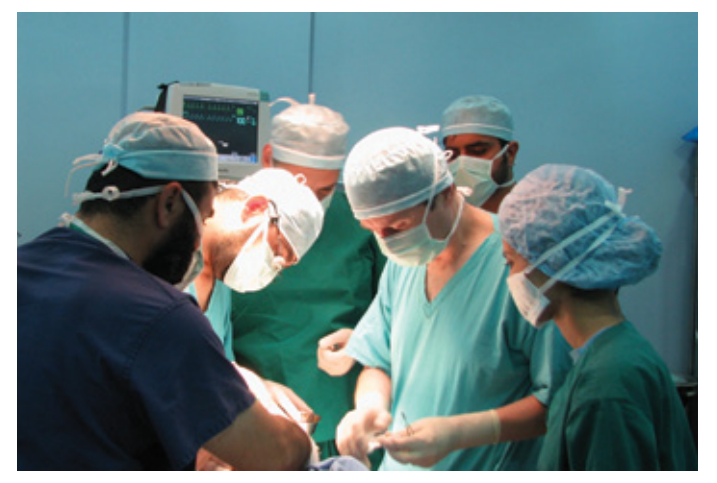
A team of surgeons prepares to operate on a 7-year-old child.

MSF does not accept any government funding for its project in Amman. All its funding comes from private donations.