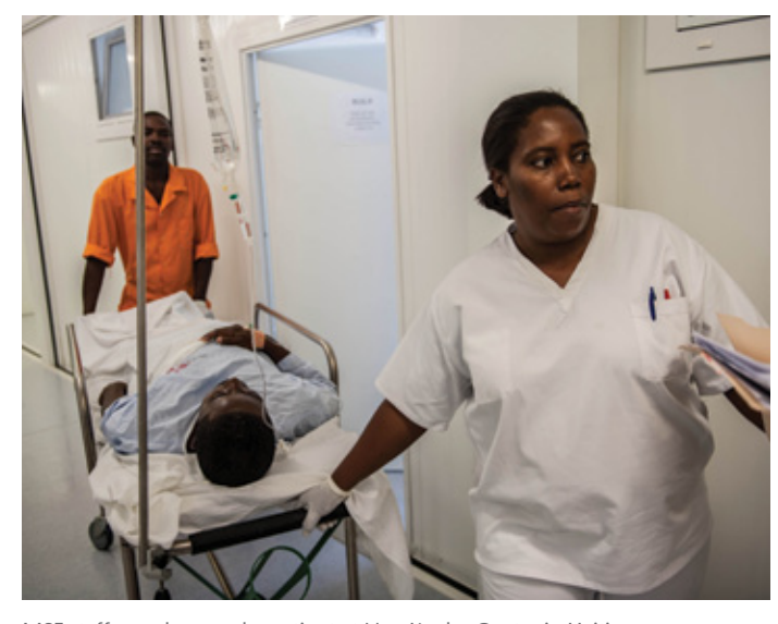
MSF staff members and a patient at Nap Kenbe Center in Haiti.