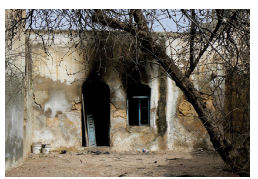
Makeshift hospital in Idlib governorate destroyed by armed forces end of March.

There is an enormous need for free quality maternal health care in eastern Afghanistan, and MSF deeply regrets that the current environment makes it impossible to continue its work at the maternity unit.