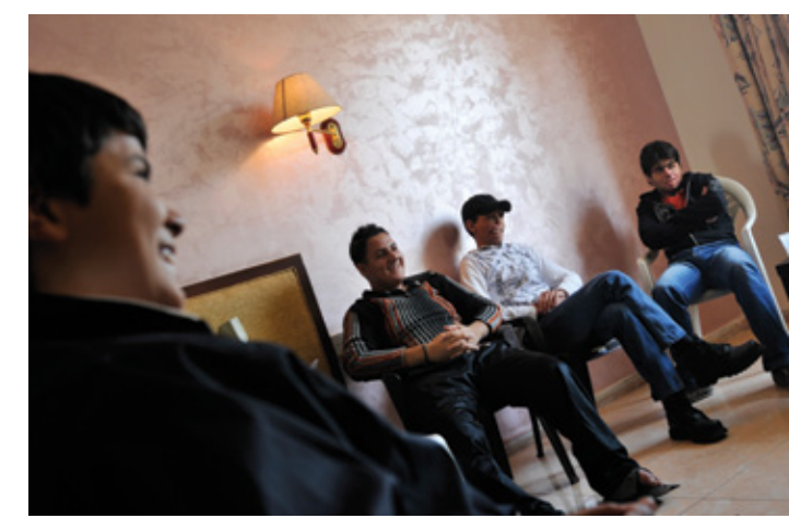
Young Iraqi men during a psycho-social group session.