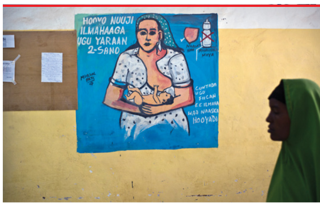
Educational mural on breastfeeding in the out patient waiting area at the hospital MSF runs in Galcayo South.