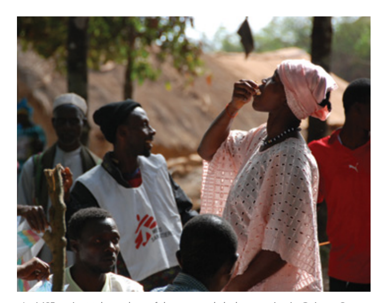
An MSF patient takes a dose of the new oral cholera vaccine in Guinea.