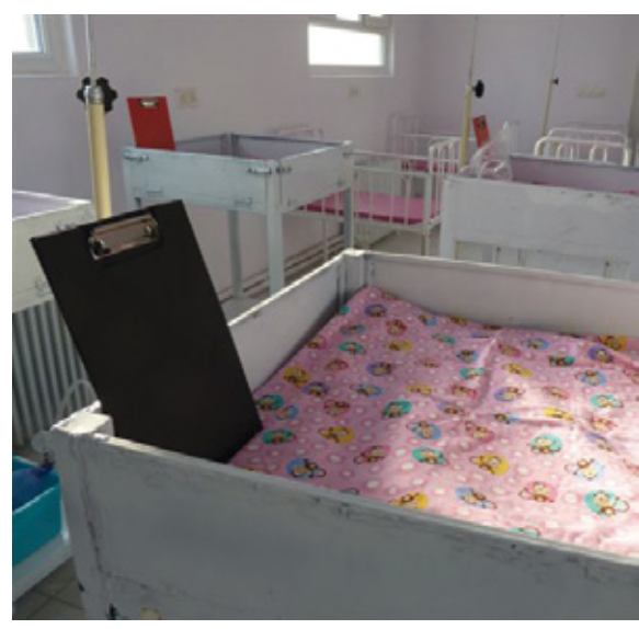
Inside MSF's maternity hospital in Khost.