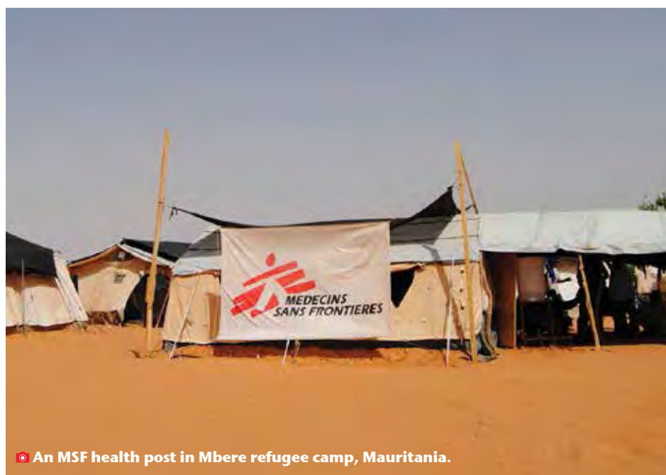
◉ An MSF health post in Mbera refugee camp, Mauritania.

Since the birth, MSF has helped the family care for the quadruplets. The youngsters are healthy and they are growing. The smallest baby was just 1.8kg at birth but that weight has climbed to 3.5kg thanks to their mother’s care, MSF’s support, and the attention of their older brothers and sisters.