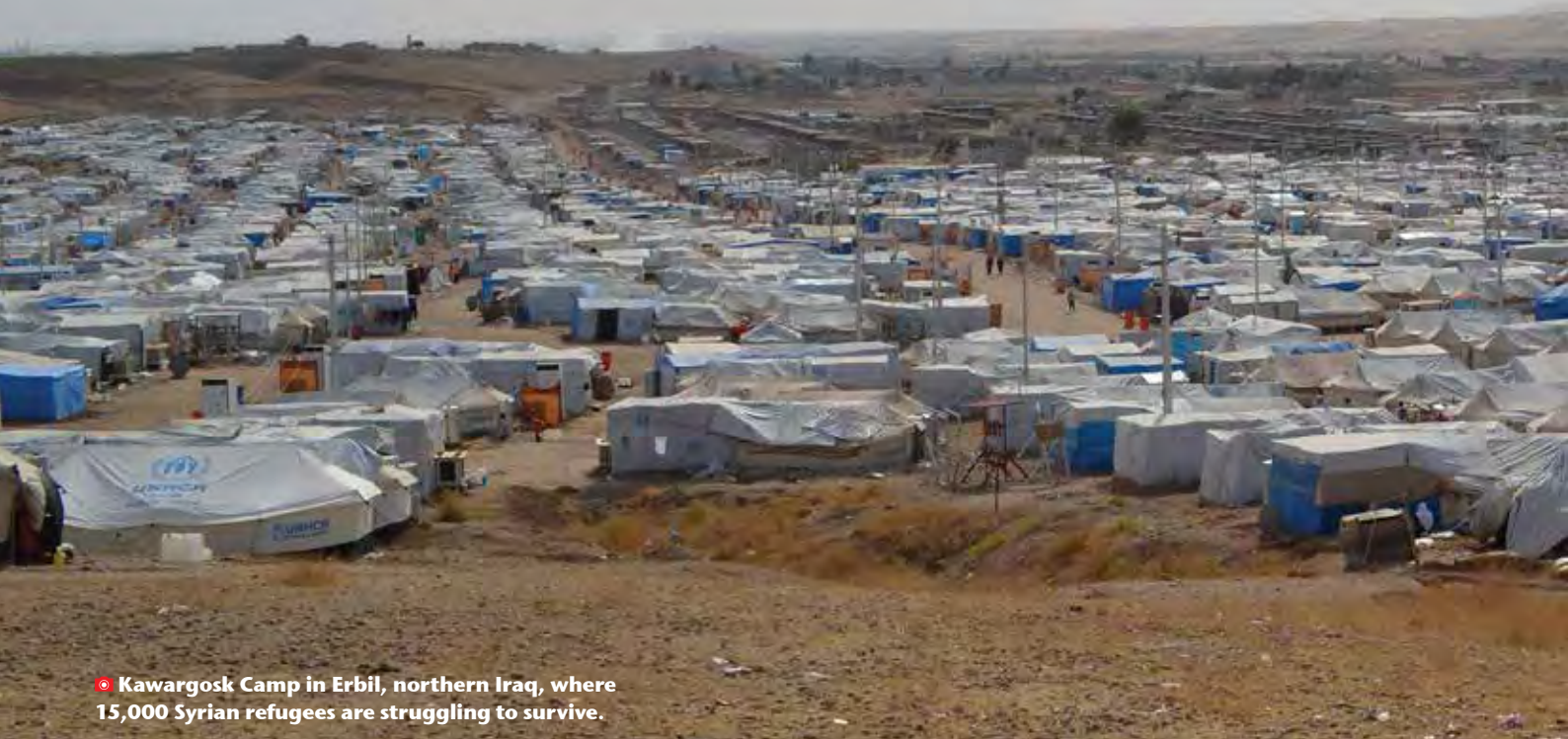
• Kawargosk Camp in Erbil, northern Iraq, where 15,000 Syrian refugees are struggling to survive.