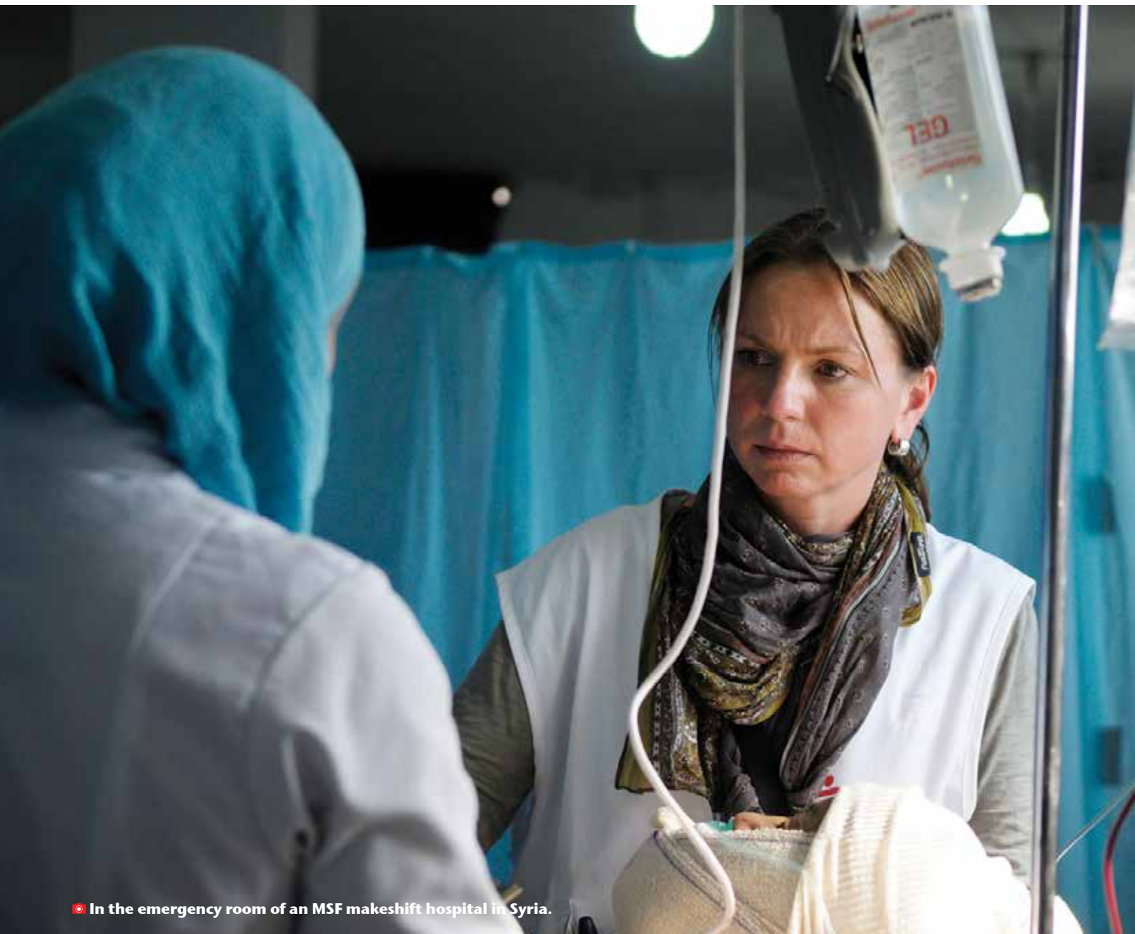
• In the emergency room of an MSF makeshift hospital in Syria.

As the bitter conflict in Syria continues, people are suffering immensely, not only from the direct consequences of war but also from having to leave their homes and belongings, and having their regular lives and medical treatments interrupted. Médecins Sans Frontières (MSF) is running programmes inside Syria and in neighbouring countries to tend to those affected.