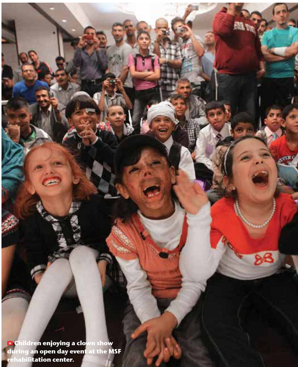
Children enjoying a clown show during an open day event at the MSF rehabilitation center.

The Amman programme is a new kind of community for the children. For the duration of treatment, it is more than just a hospital for them, it's their world. One in which we aim to help them gain the ability to function better when they return home.