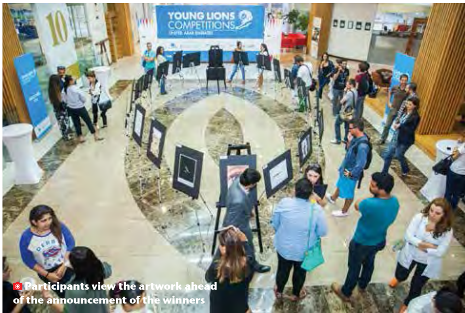
Participants view the artwork ahead of the announcement of the winners

The UAE's most creative young minds took part in a thrilling media challenge in support of MSF. The Young Lions competition was open to advertising professionals up to 28 years of age, and participants took part in teams of two, consisting of an art director and a copywriter. The twelve teams were asked to produce a campaign of global standards for MSF, and then had to quickly produce two print ads in just eight hours.