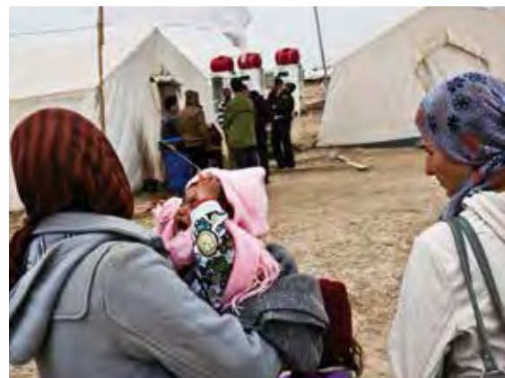
A Syrian refugee carries her child to the MSF clinic at the Domeez camp in Iraq

“The relief of seeing our colleagues return