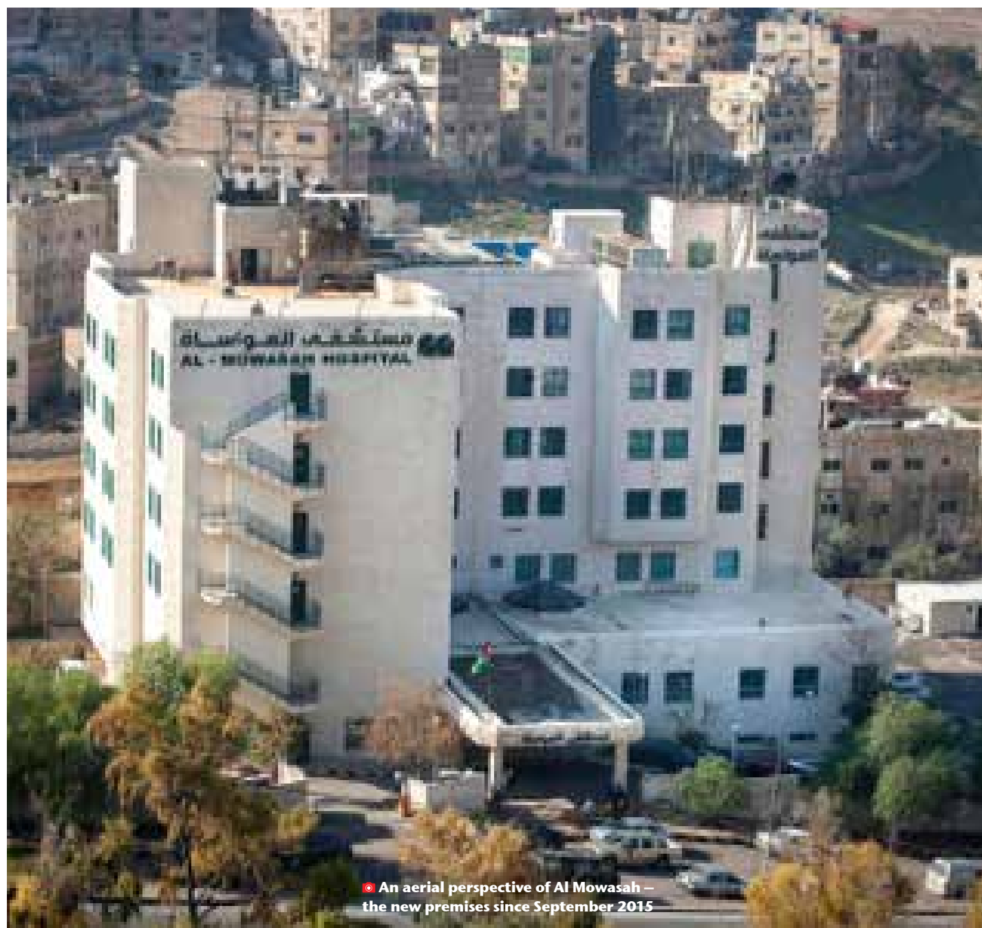
◉ An aerial perspective of Al Mowasah – the new premises since September 2015

It's difficult to narrow it down to a single case. I remember one girl who was badly injured in a car bomb. She lost her mother, she lost her sight. That was really emotionally difficult for me. I remember a boy with facial damage, he came back many times. When I first met him, he was a child, he's a man now. Another boy I treated had a crushed leg – he has a wife and daughter now. Many of the female patients I treated are now mothers. There are so many I could talk about. In my time here, we have treated almost 4000 patients. ■