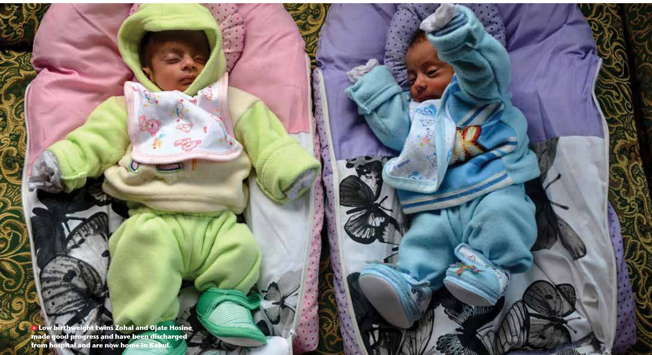
• Low birthweight twins Zohal and Ojate Hosine made good progress and have been discharged from hospital and are now home in Kabul.