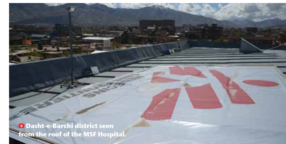
• Dasht-e-Barchi district seen from the roof of the MSF Hospital.