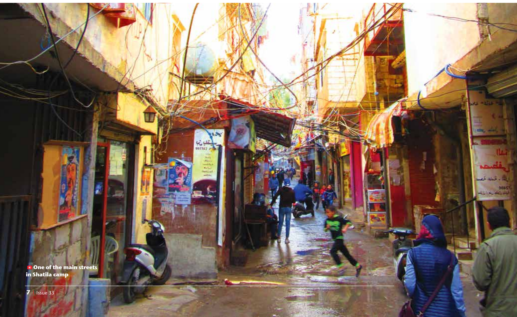
• One of the main streets in Shatila camp

to send them. But one of the organisations running a school here promised me they would integrate my boys into a class next year.